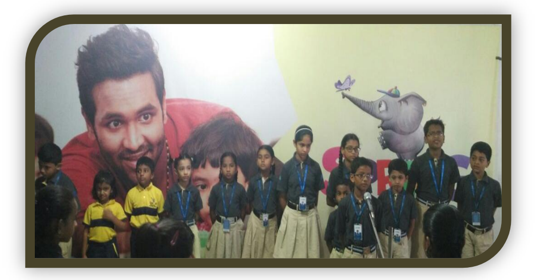
\mbox{OMT}(\mbox{One Minute Talk} ) by the students of grade I to V