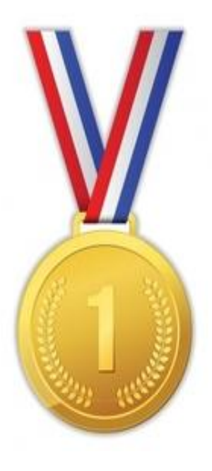
Winners of the Spell Bee Competition