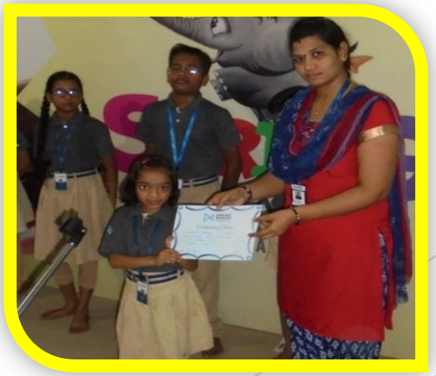
Presentation of Certificates to the Participants