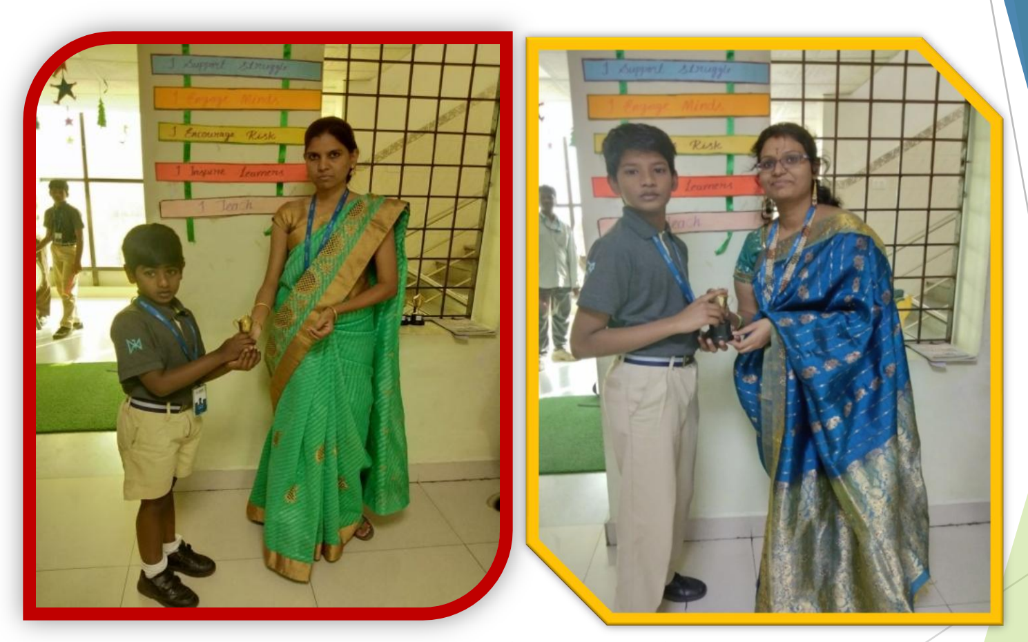
Winners being rewarded