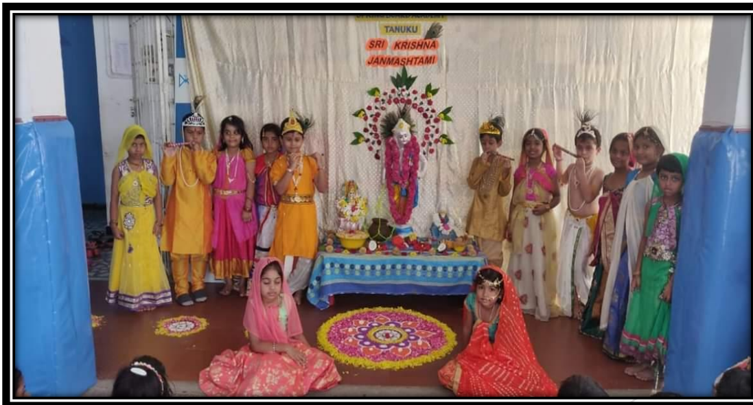
The Little Krishnas and Gopikas