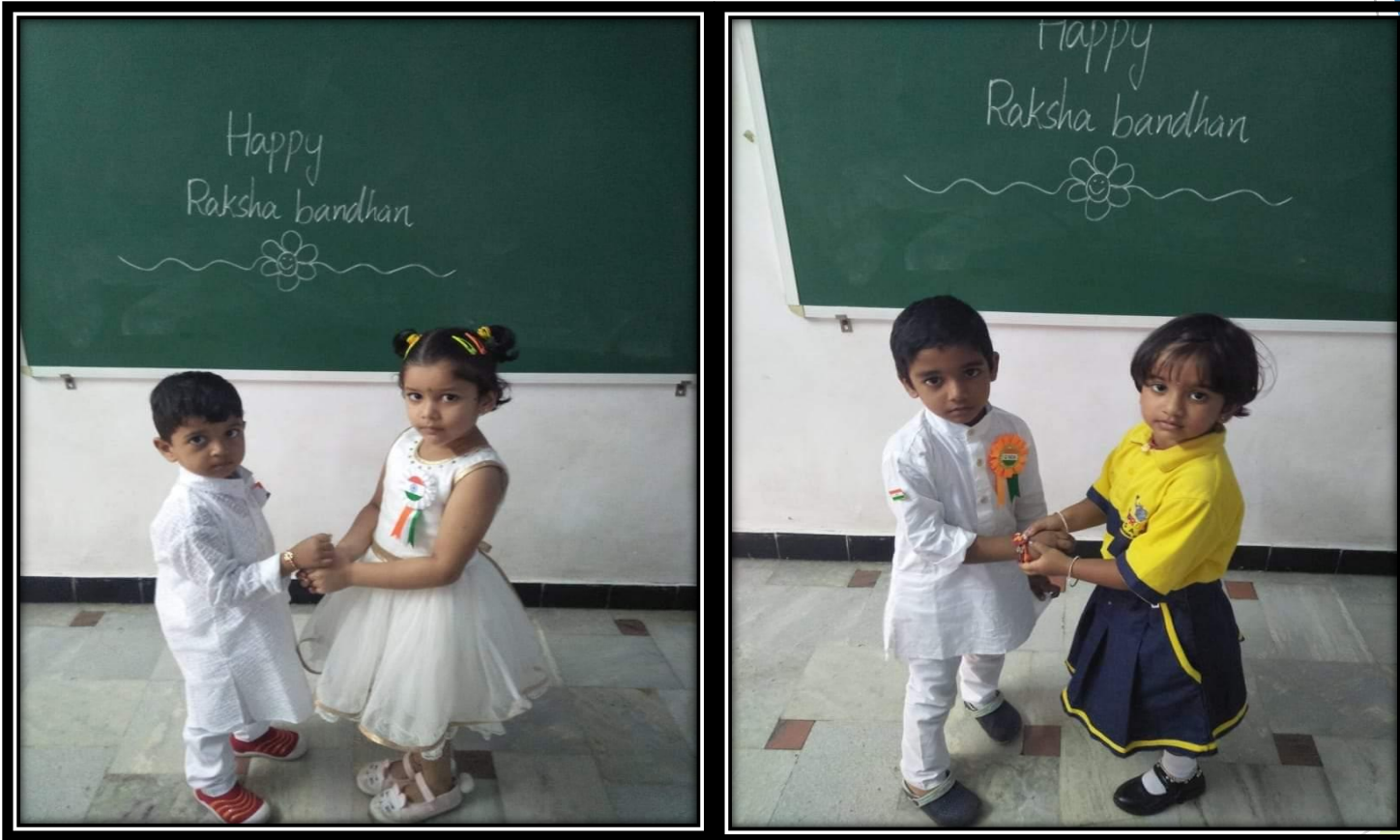
Little kids tying Rakhis to their classmates