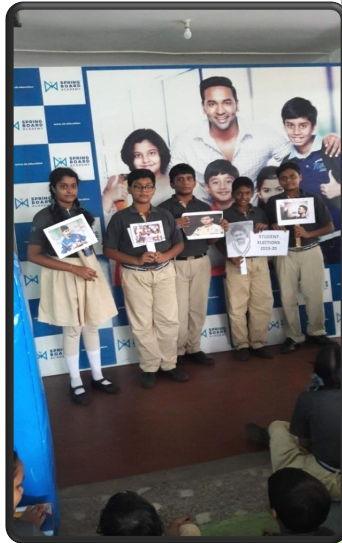
Competent contestants Canvassing in the campus holding their Symbols of Nomination