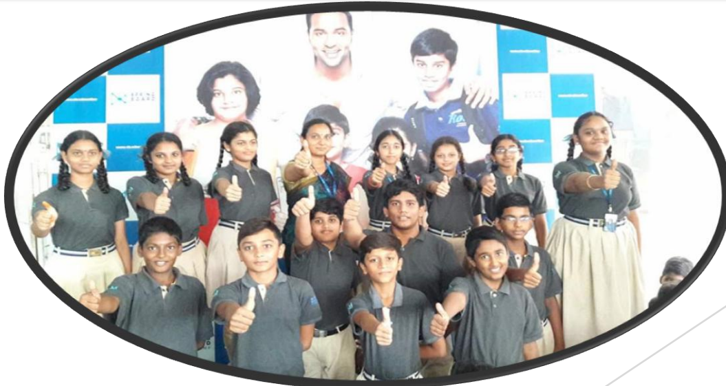
Students casting their vote