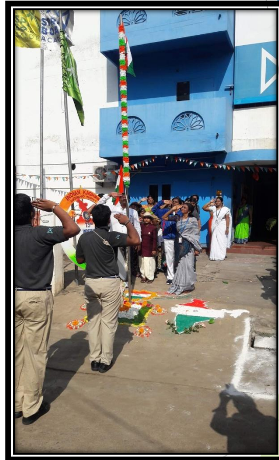
The moments of celebration