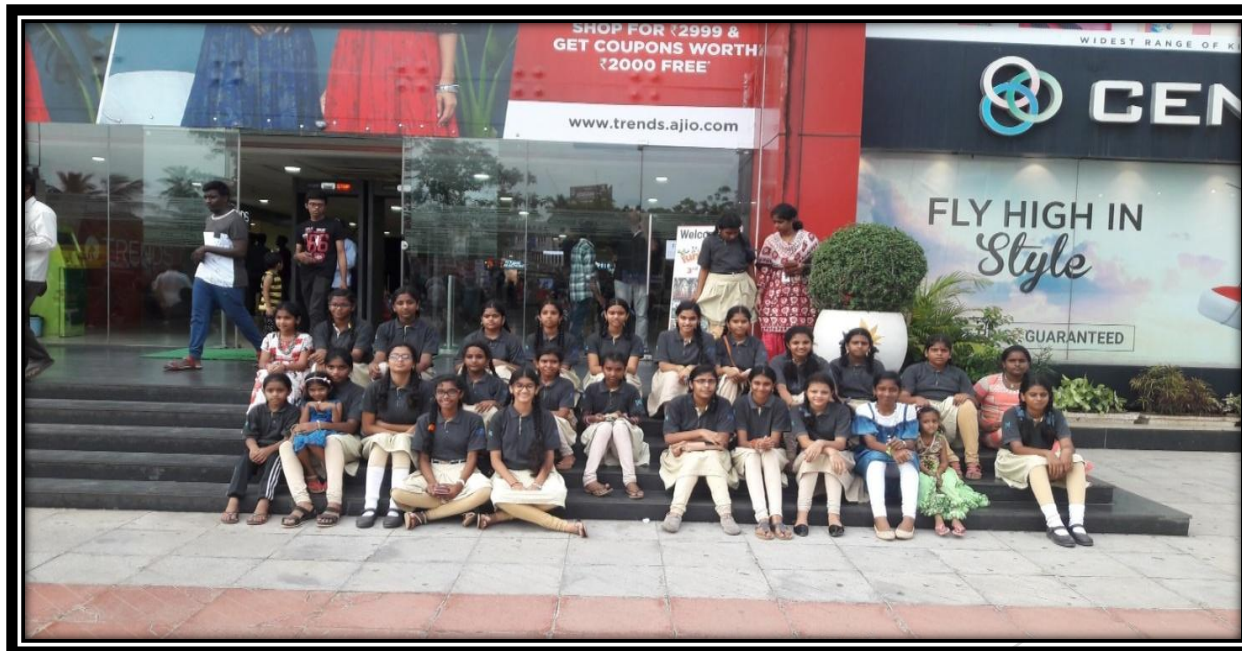
Students at Multiplex

As a part of field trip, primary students visited the nearby police station, Reliance Super Mart, and a park. Students of grade 6 to 10 have visited Bhimavaram. Jain Temple was the center of attraction for everyone. The temple is made of marble stones and the designs are carved in a unique way. They visited Multiplex where they had a lot of fun by playing different games.