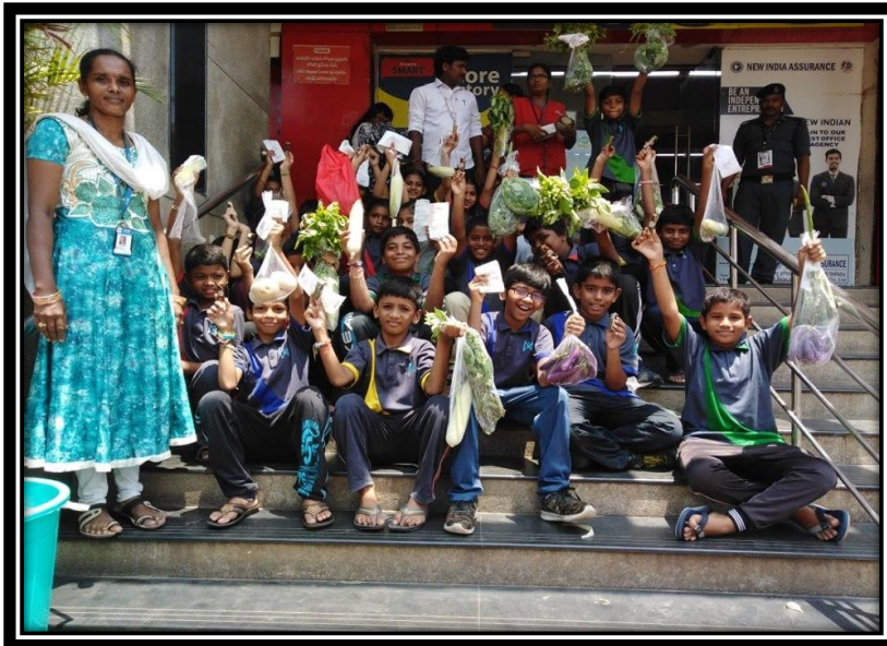
Children enjoying in the park and Reliance SuperMart