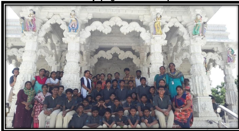
Students at Jain Temple