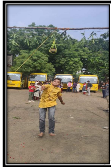
Kids involved in utti breaking festival