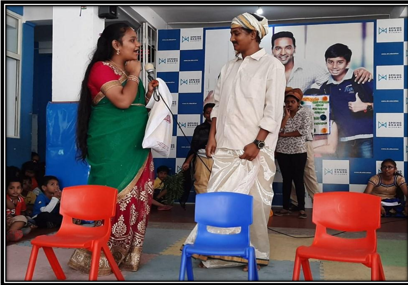
Students performing different activities on Telugu Bhasha Dinostavam