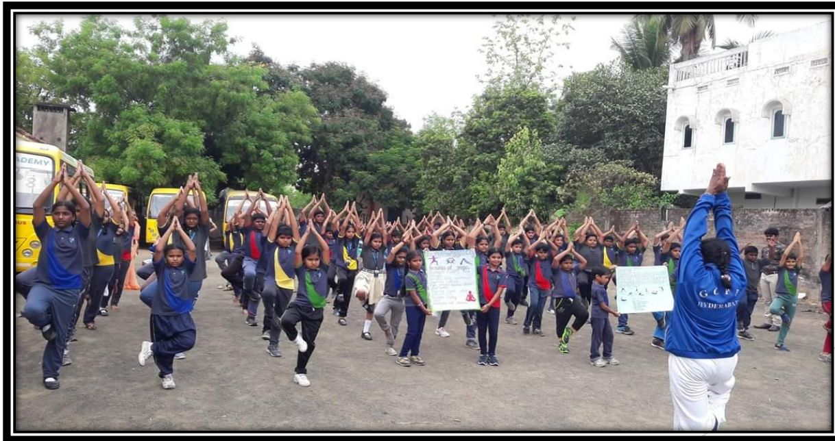
Children performing Yogasanas

5th International Yoga Day was celebrated in our branch with its true spirit. Students were educated about advantages of practicing yoga. Students performed a few yoga postures under the guidance of teachers.