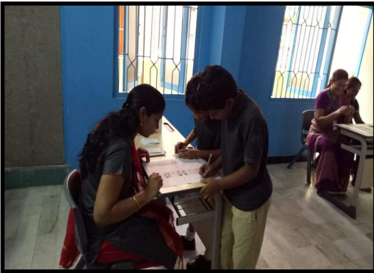
Students casting their vote