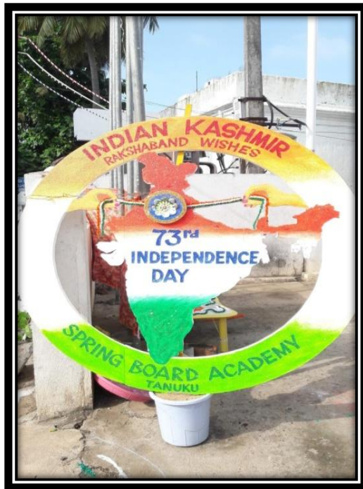
Swing of patriotism in the campus

The whole campus was decorated with tricolor balloons and flags on the day. Flag hoisting was done by the principal. The speeches given by students and teachers , motivational songs and energetic dance performances by students filled the atmosphere with everlasting patriotism. Children came dressed as freedom fighters . The celebrations concluded with the distribution of sweets.