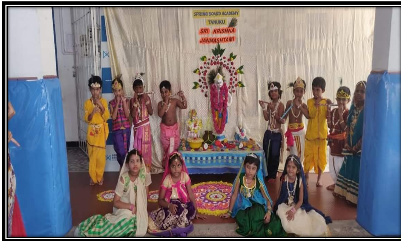
The Little Krishnas and Gopikas

On the day, campus was decorated with the little foot prints of Krishna and our little toddlers came in the attire of lord Krishna and Gopika. The event concluded with utti breaking event.