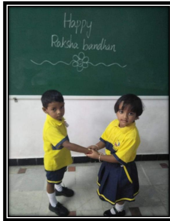
Little kids tying Rakhis to their classmates