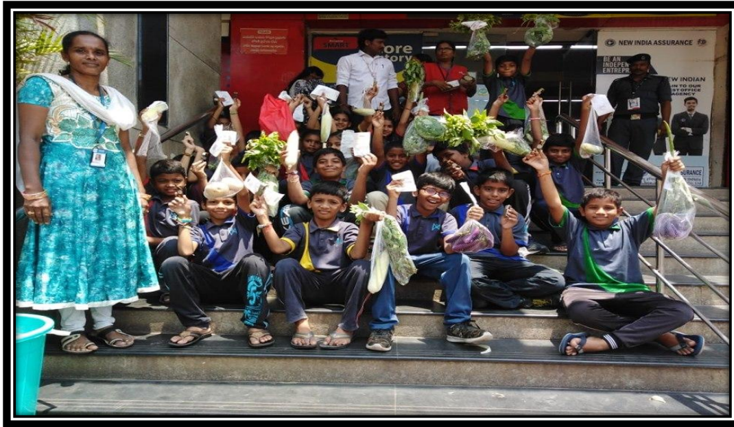
Children enjoying in Reliance SuperMart