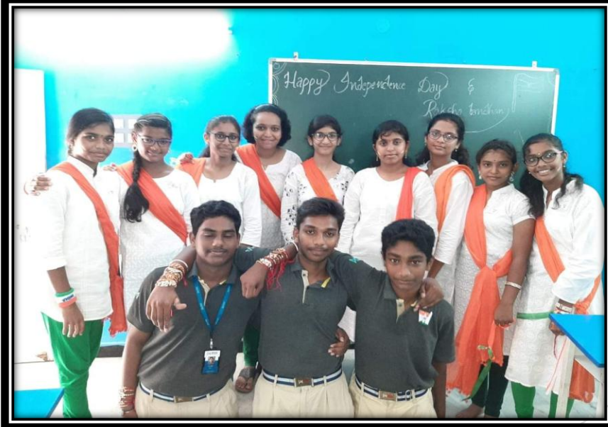
A few snaps of the celebration.