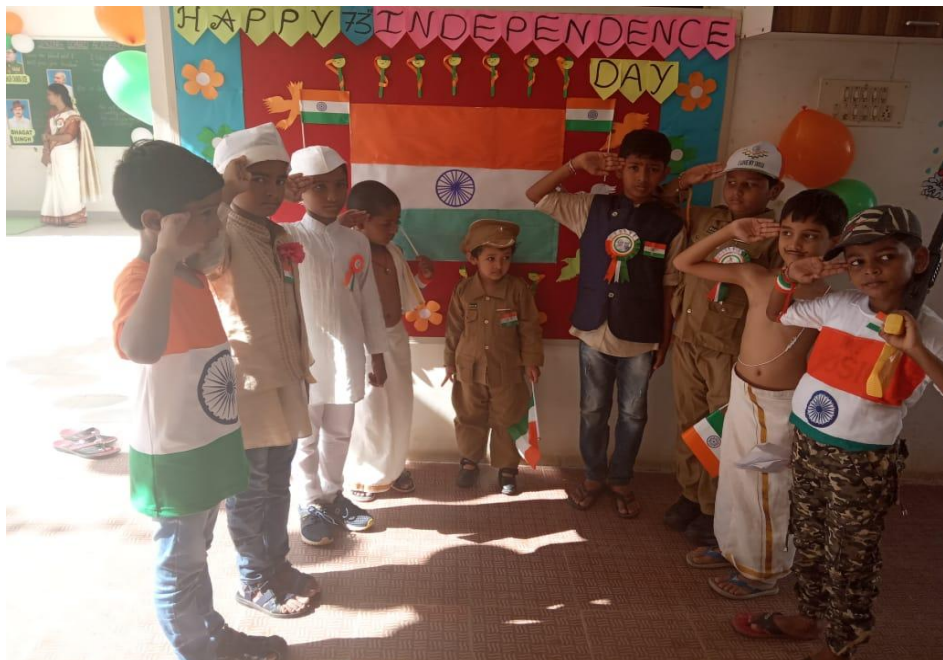
Students dressed as national leaders