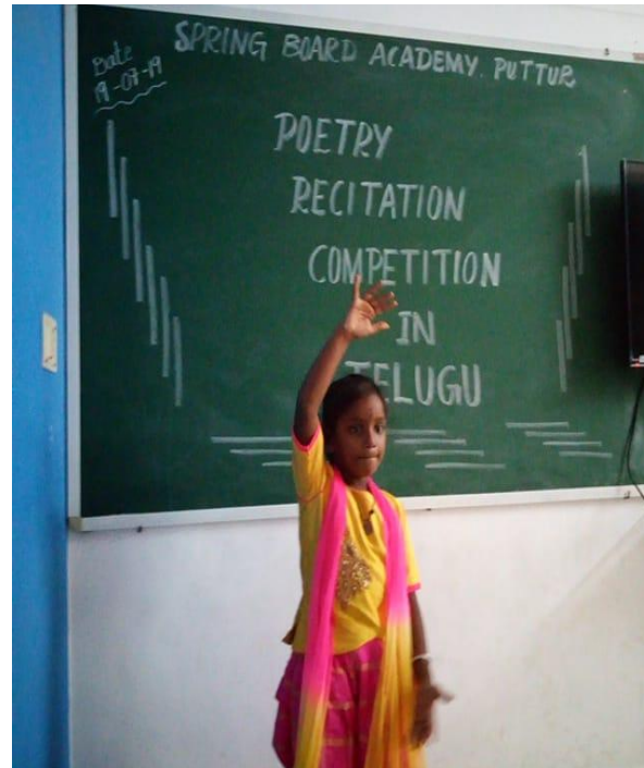
Students reciting Telugu poems