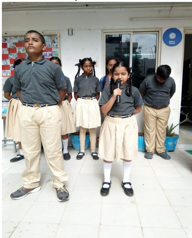
Speech by teacher and student on Quit India Day