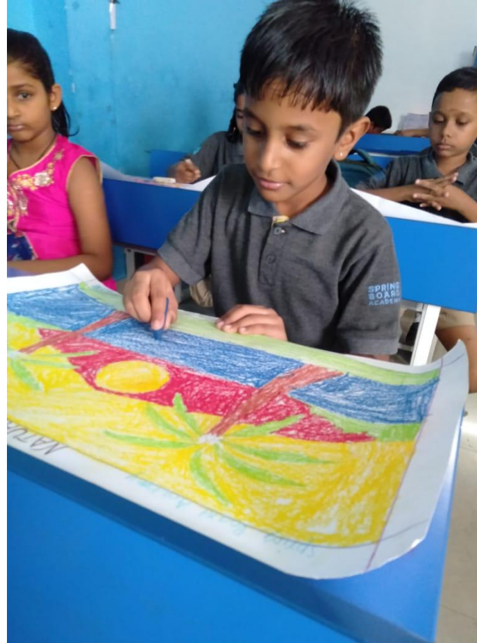
Drawing by our primary students