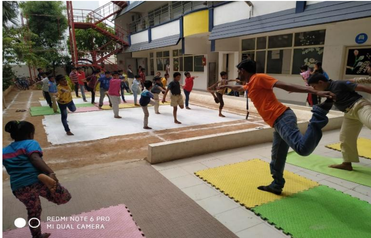
Students performing yoga on International Yoga Day