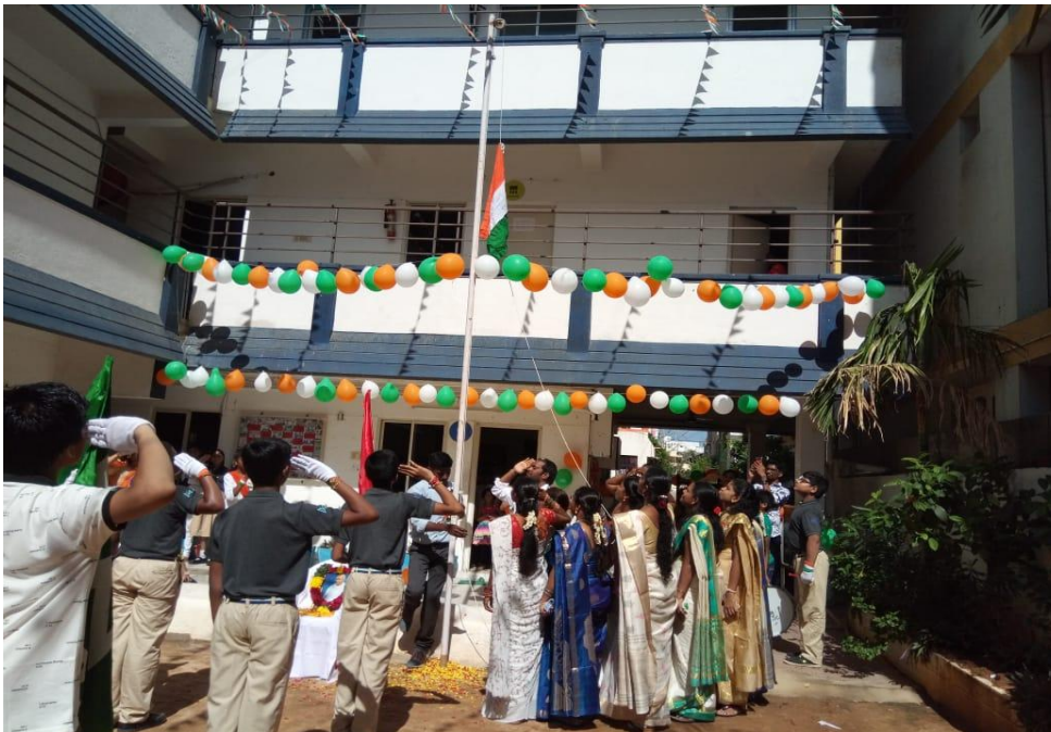
Flag hoisting by Principal