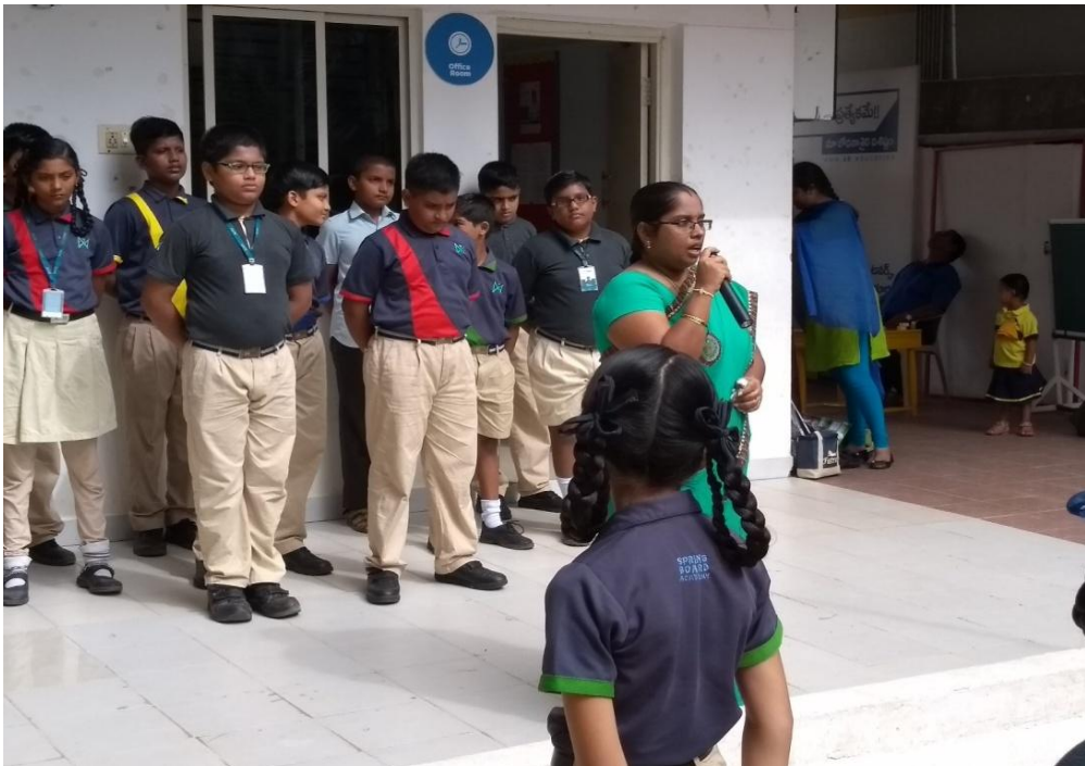
Speech by teacher on World Population Day