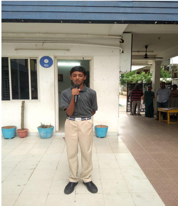
Speech by a student on World Blood Donor Day

On 14 June, countries around the world celebrate World Blood Donor Day. To mark the importance of the day, at Spring Board, children were made aware of the importance of donating blood to the needy