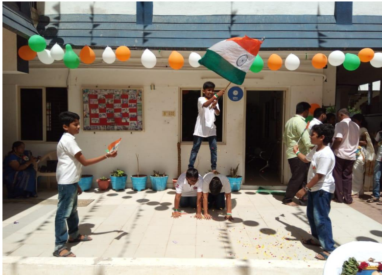
Dance performance by the students