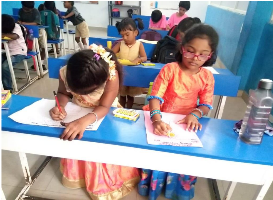
Drawing by our primary students