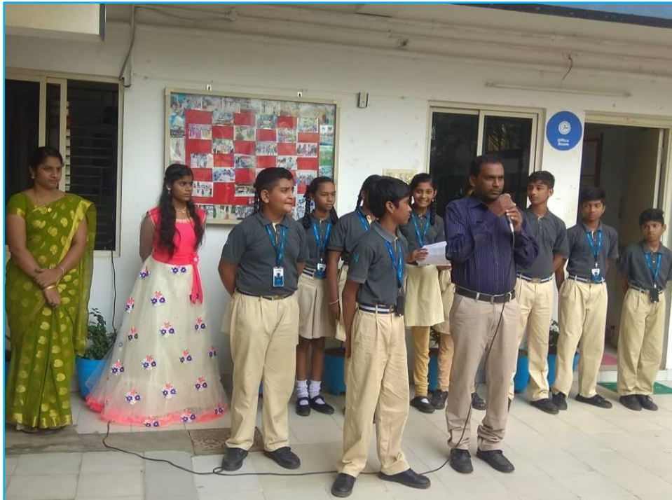
Observance of National Energy Conservation Day in the branch

Science teacher and students delivered speeches on this occasion.