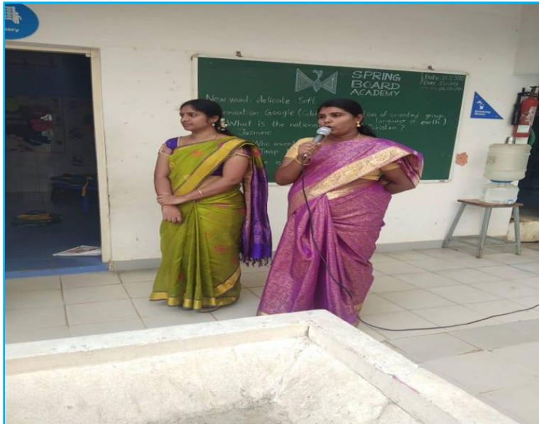
Teachers giving speech on the significance of Christmas

Children dressed as Santa Claus, danced to the beats of “jingle bells” and wished all a merry Christmas. Mathematics teacher spoke about the purpose of the birth of Jesus Christ and the essence of Santa Claus in Christmas celebration.