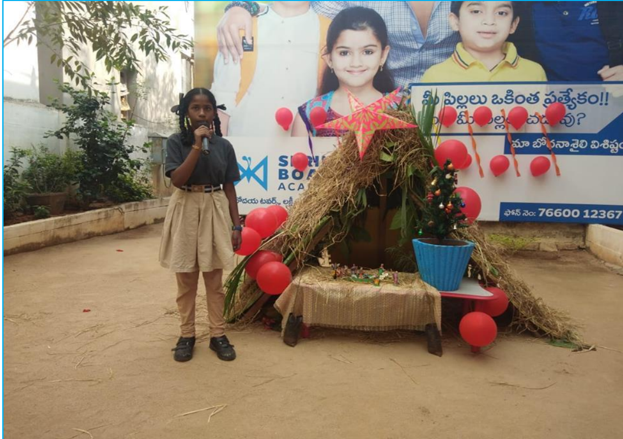
Speech by a Student of Grade 8