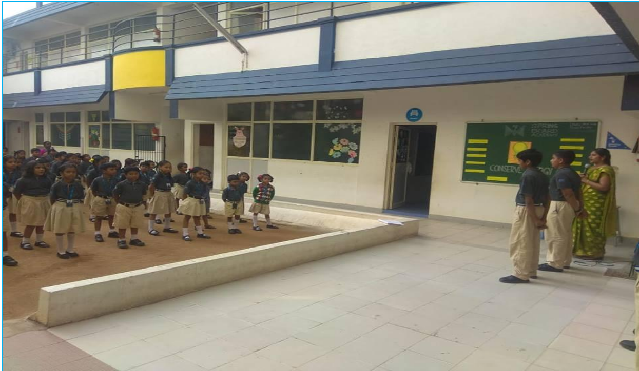
Observance of National Energy Conservation Day in the branch