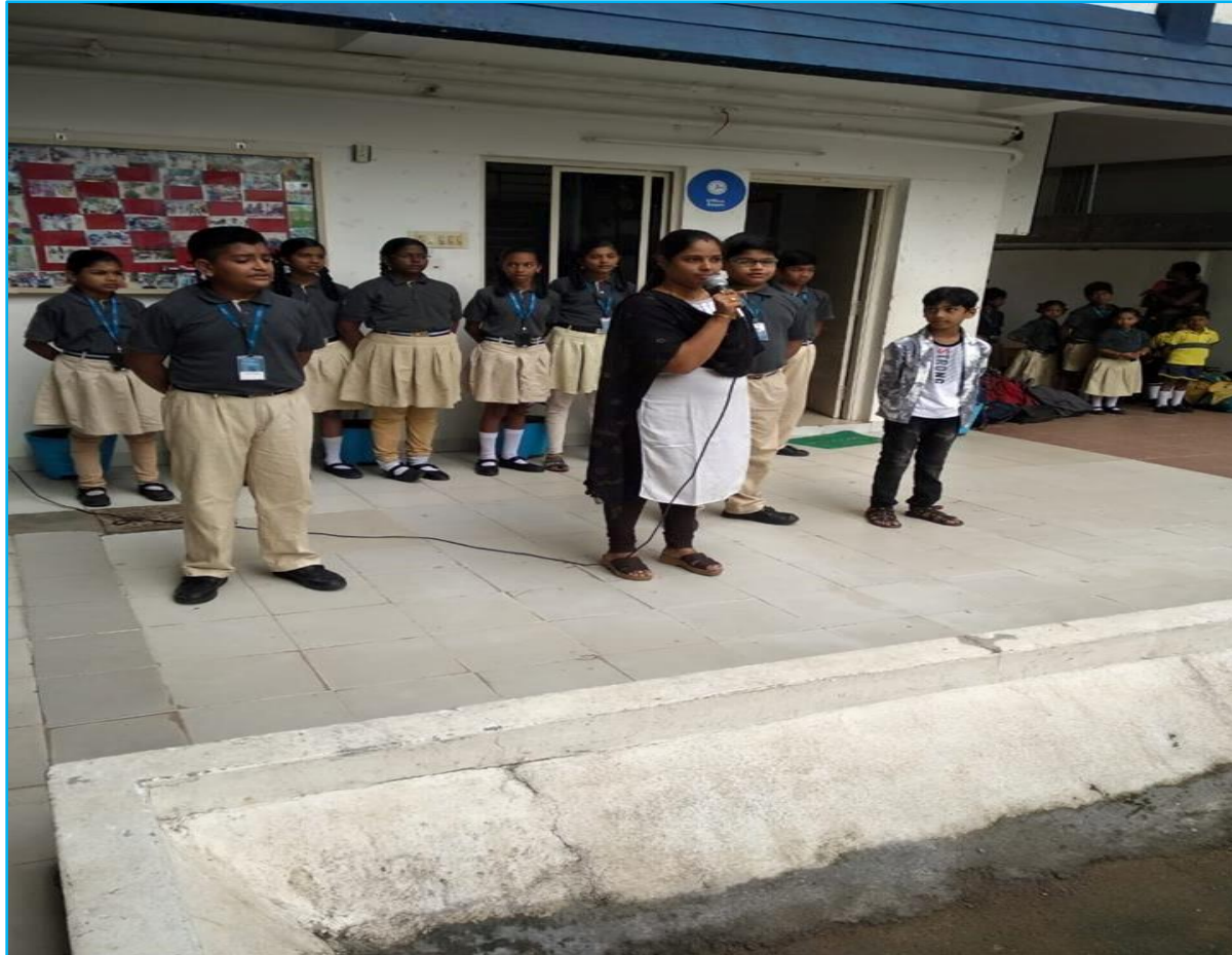
Social Teacher Delivering speech