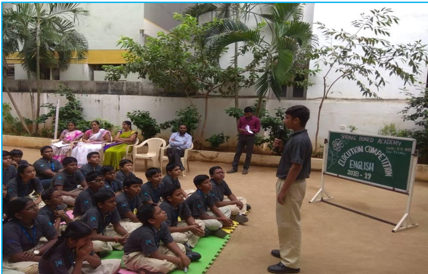
Children participating in Elocution Competition