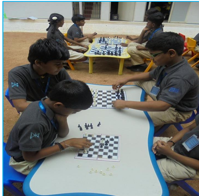
Participants engrossed in Chess Competition