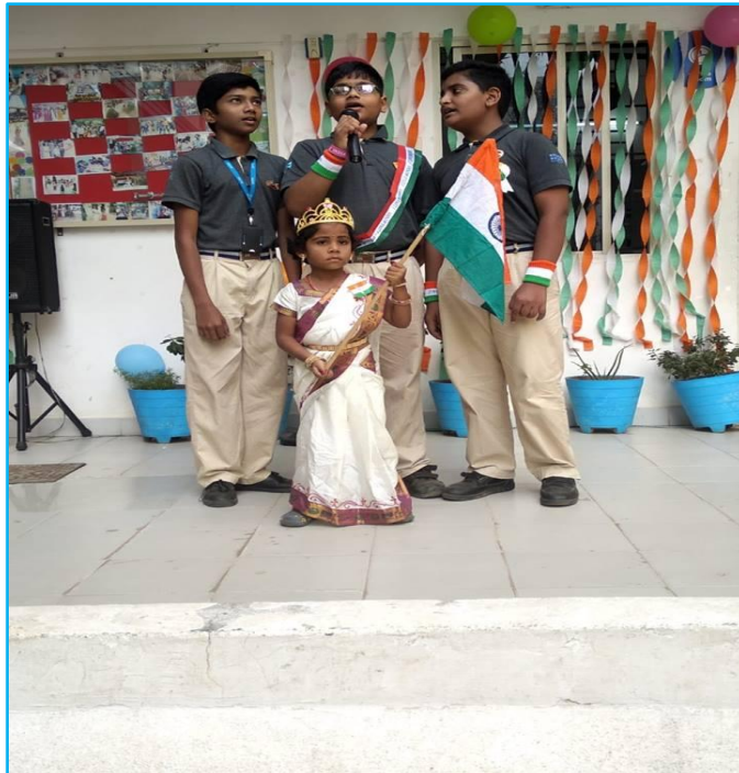
Students singing patriotic song

Students participated actively in cultural programmes like singing patriotic songs, dancing, performing pyramids etc.