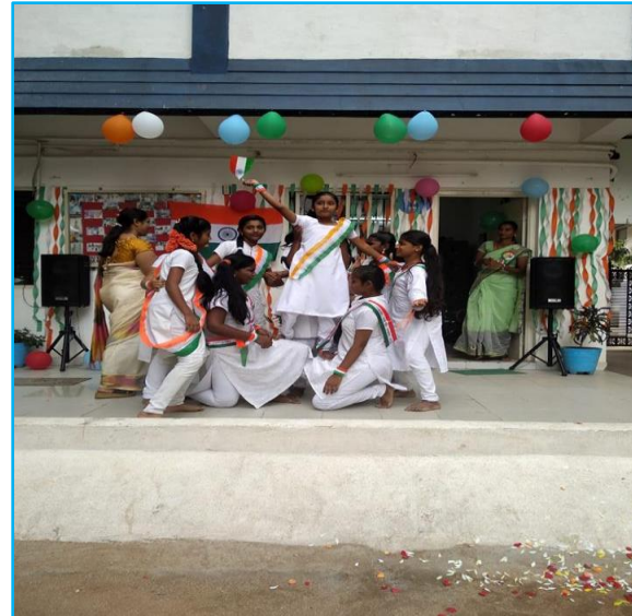
Dance by the students