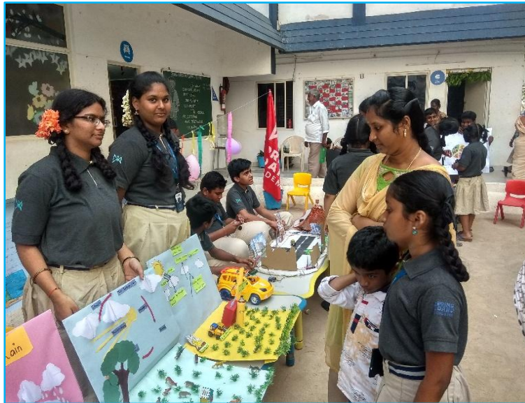
Students with their models in the Science Fair