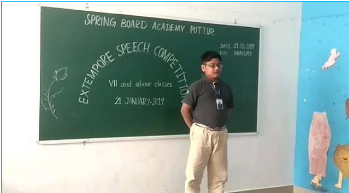
Students actively participating in Extempore Speech Competition.