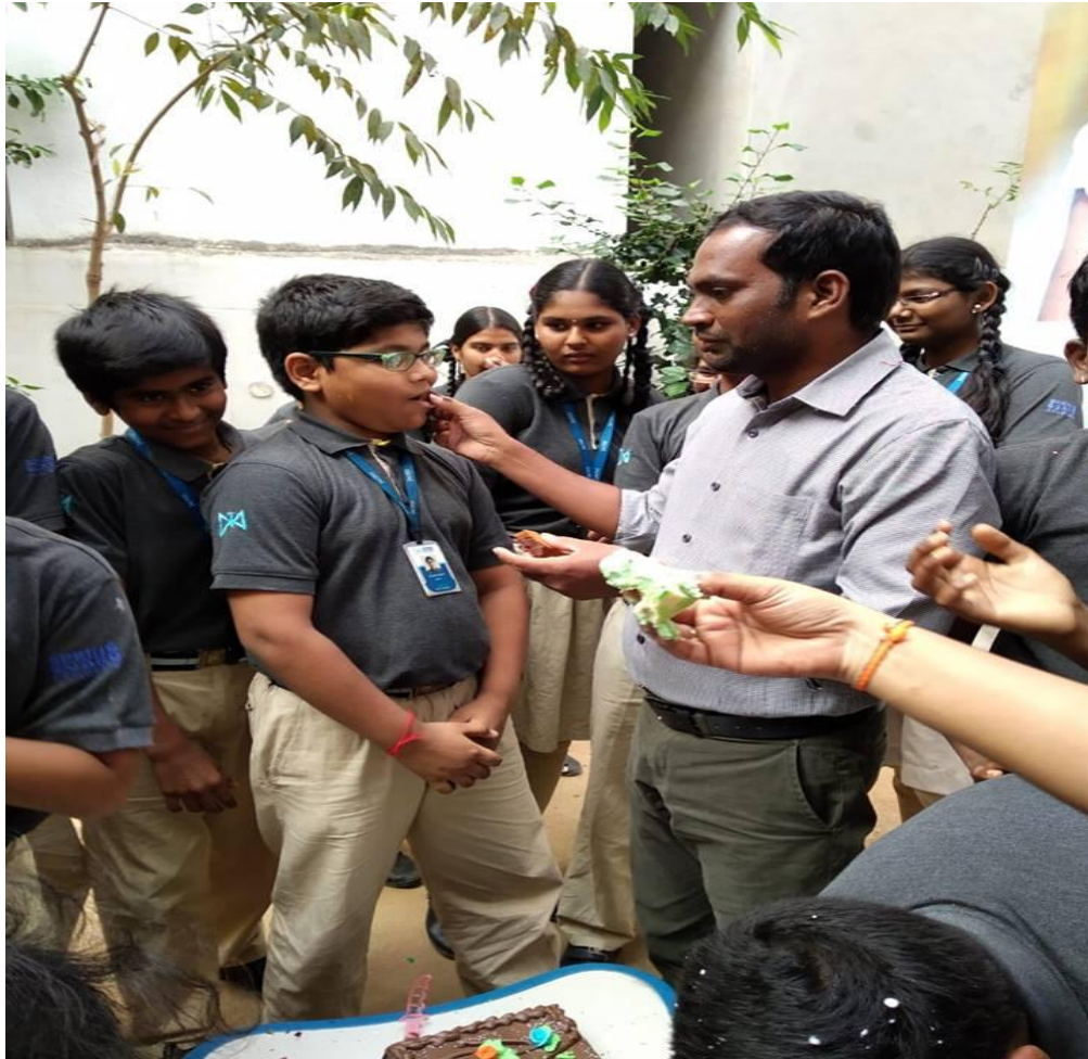
New Year celebrations in the branch.