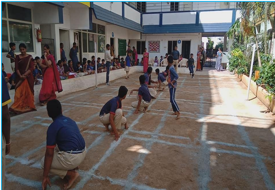
Students playing games enthusiastically.