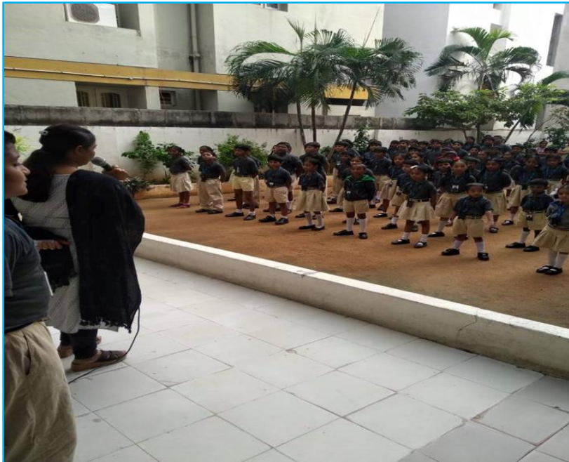
Social Teacher Delivering speech

Social teacher and students shared their views on human rights as well as fundamental rights.