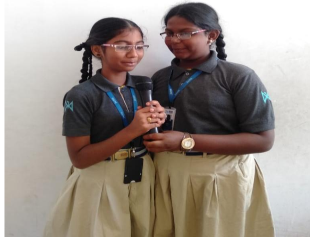
Students giving solo and group performances.