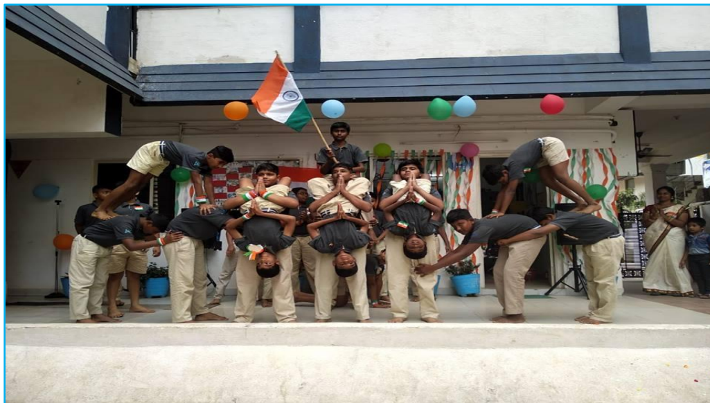
Pyramid formation by Boys. Dance by the students of grade V and VI