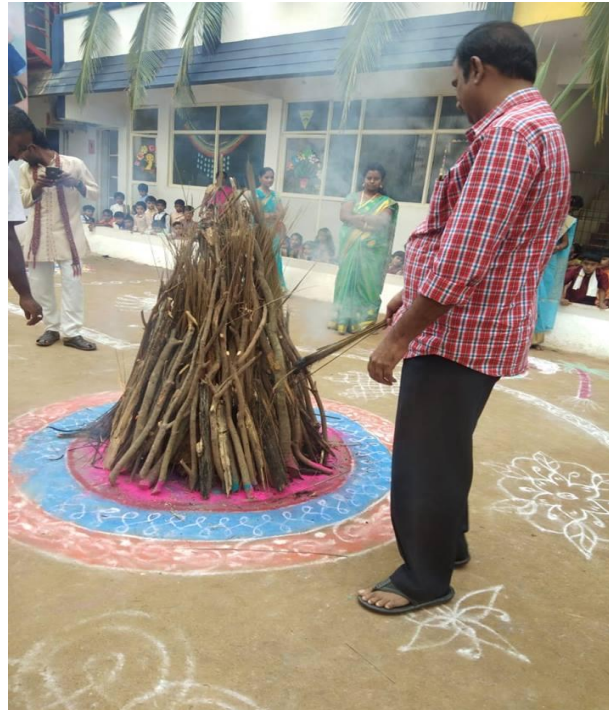
Sankranthi Celebrations in the Campus