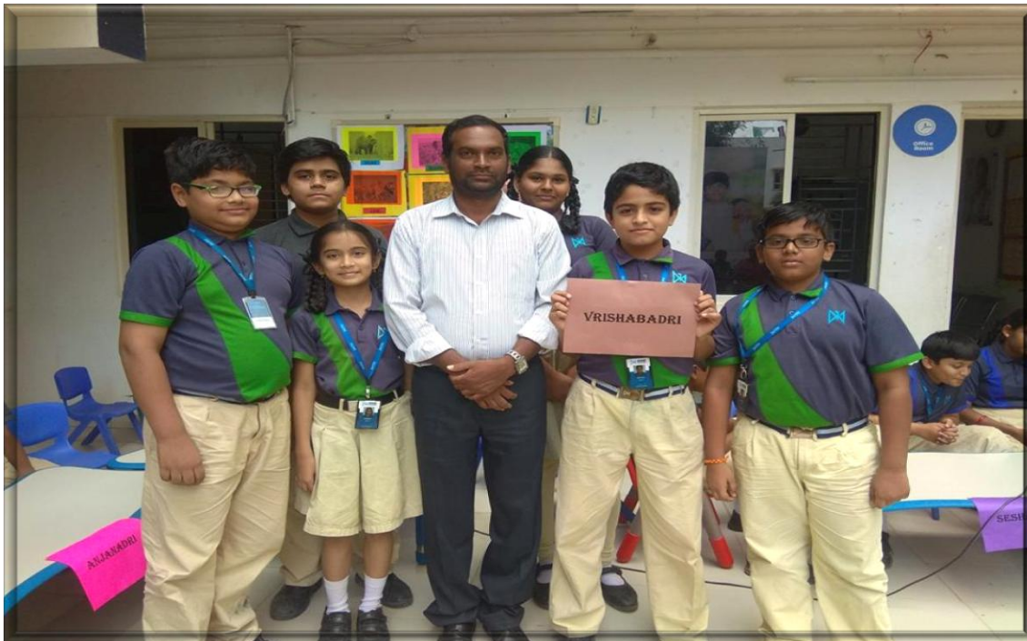
Vrishabadri won the competition

An inter house GK Quiz was organized, in which four different houses with five fervent participants gave a tough competition to each other. The participants had to go through mazes of intuit and mind-boggling rounds consisting of questions related to wild life. Finally, Vrishabadhri team won the competition.