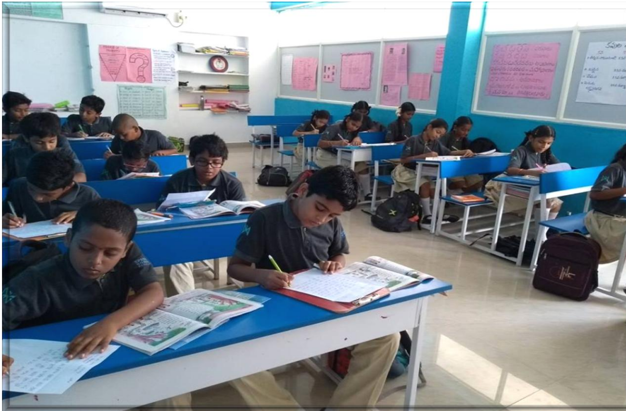
Students participating actively in Hindi hand writing competition

To develop awareness and love for good handwriting, Hindi hand writing competition was conducted on 11 th September, 2018. Students were asked to write one page of Hindi content. All the students participated enthusiastically.