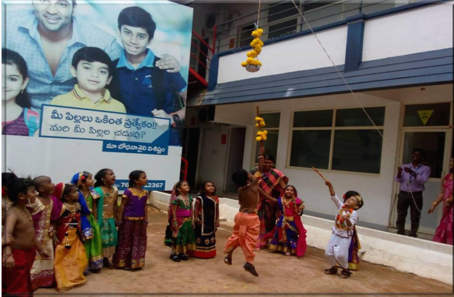
Children enjoying while breaking the matka