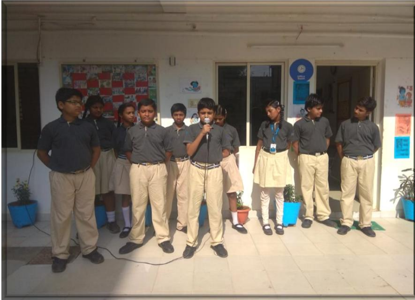
Speech by a student of Grade 6