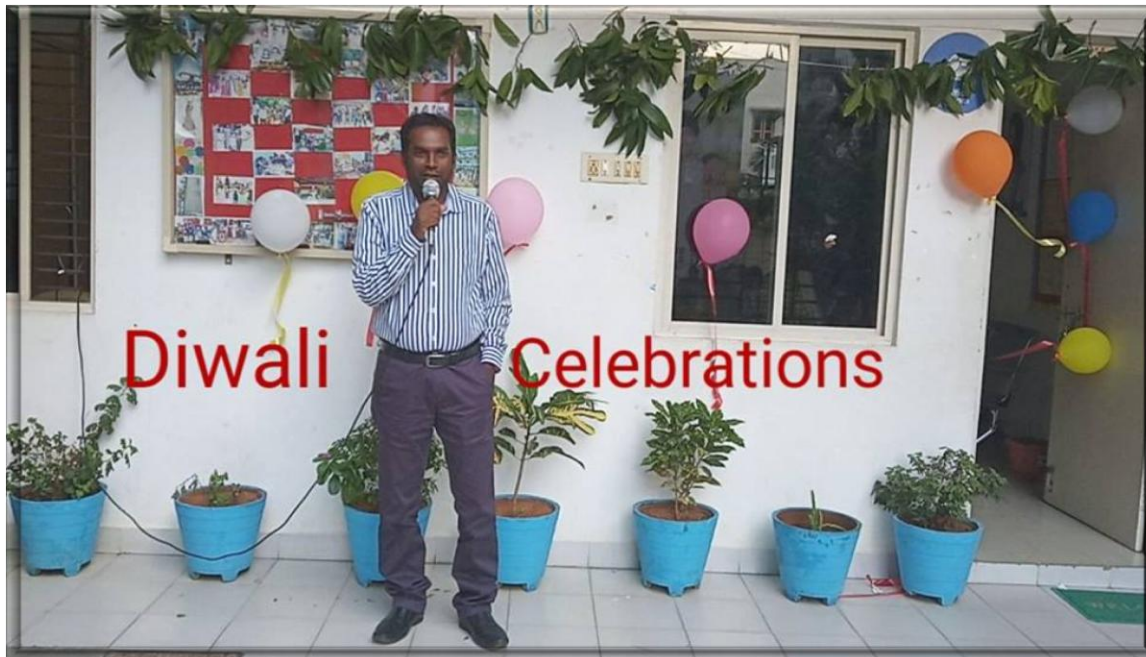
Principal delivering speech

Students spoke about the significance of the festival - how good always conquered over the evil and also about why and how Diwali is celebrated across India. Principal and teachers instructed students on the safety precautions while bursting crackers.