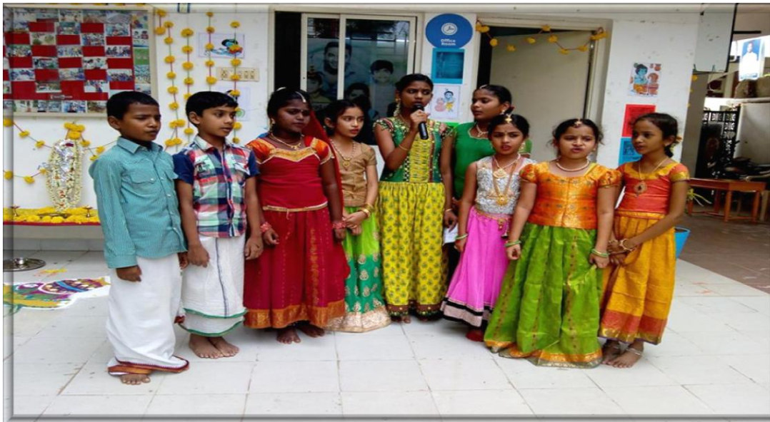
Children reciting slokas