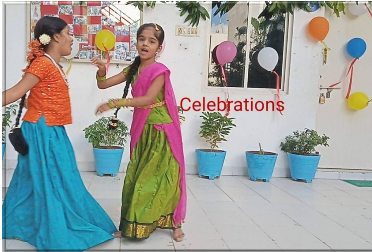
Dance by the students of Grade 3