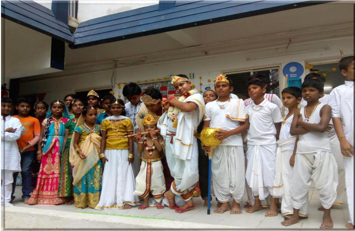
Children presenting a skit