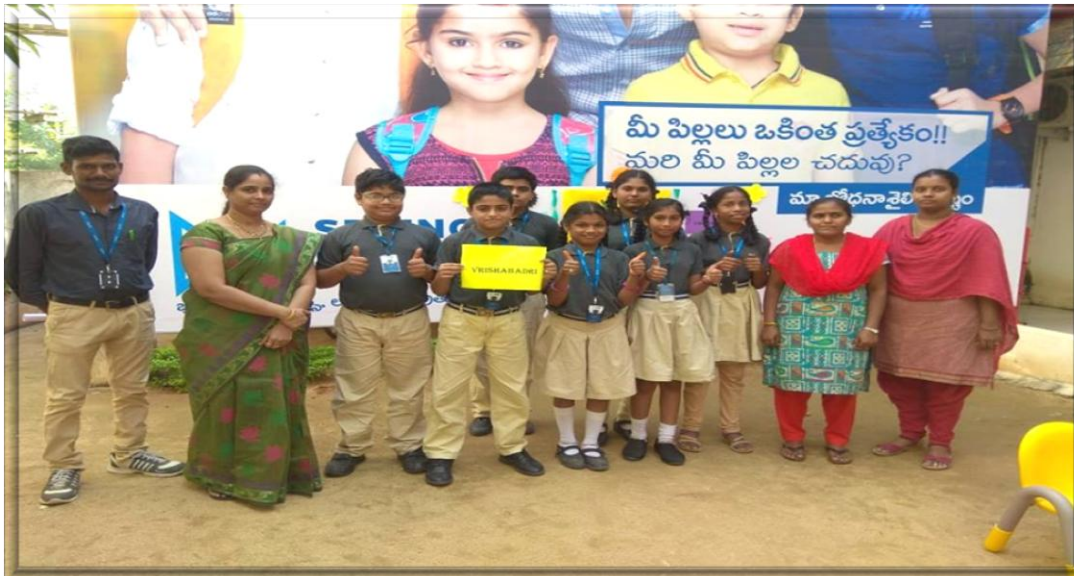
Winners of the competition