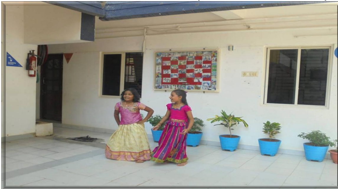
Students dancing in traditional dresses

The event started with lightning a lamp by the Principal. The main reason behind organizing the show is to nurture talents of students and to make students more confident, which ultimately helps in personality development. The competitions such as group dance, group song, mimicry, and storytelling were conducted for the students. Students performed enthusiastically.