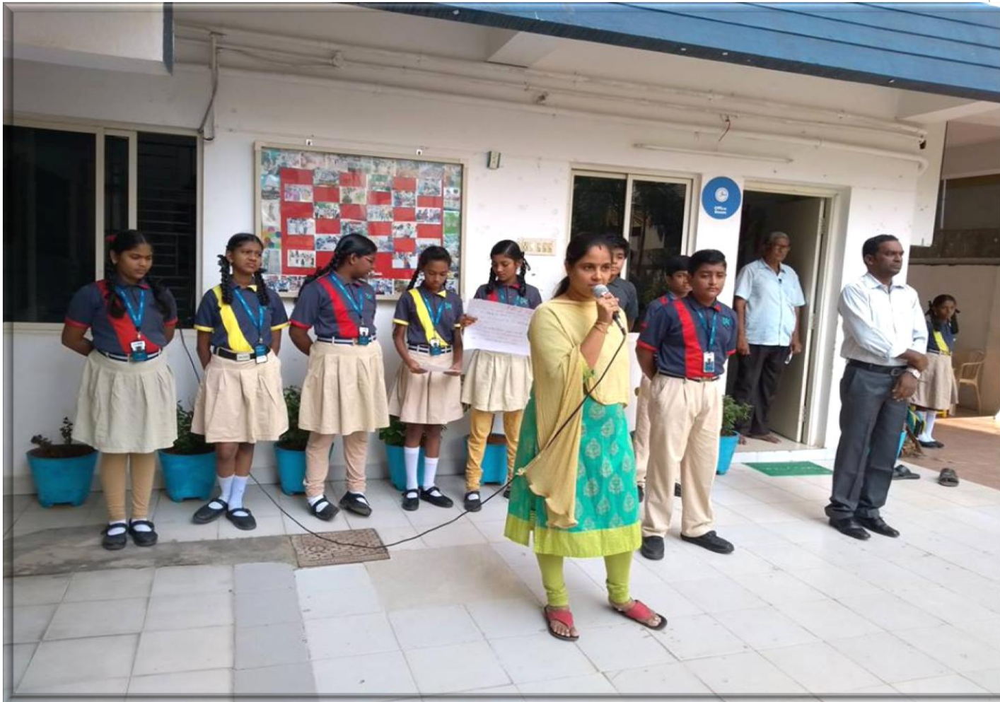
Teachers delivering speech on importance and achievements of UNO