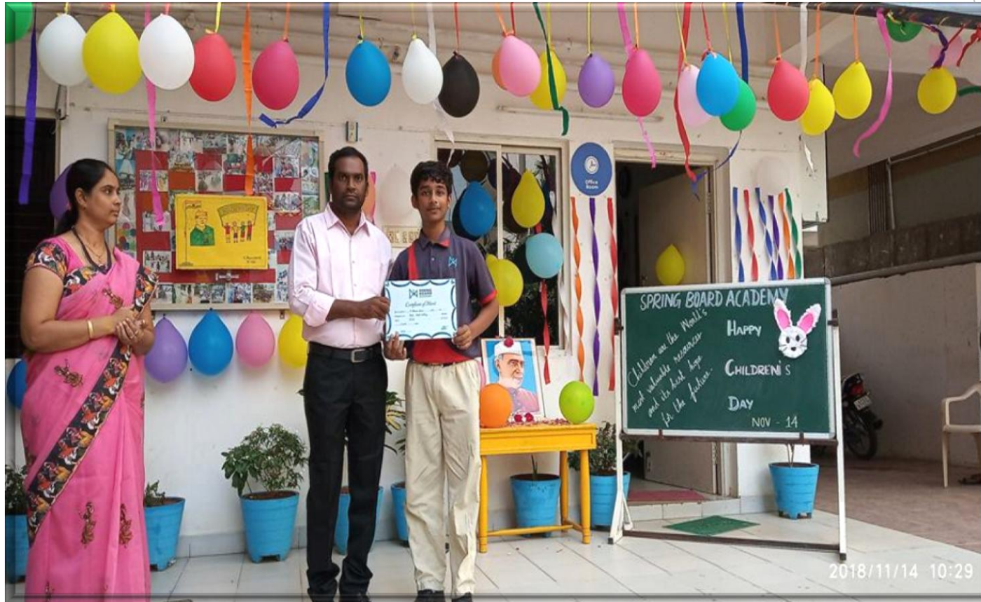
Principal distributing prize