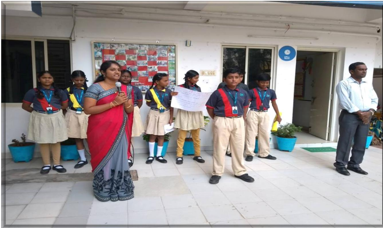
Teachers delivering speech on importance and achievements of UNO

A special assembly was conducted in the campus on 24 th October, 2018 to observe United Nation's Day which was established in 1945. United Nation's Day is observed diligently every year in India. Principal and teachers explained in detail about the importance of UN agencies and the achievements of UNO since its establishment.