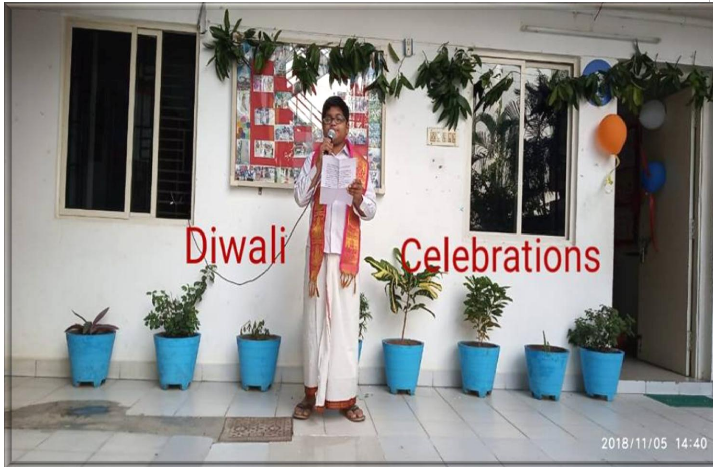
Speech by a student of Grade 9