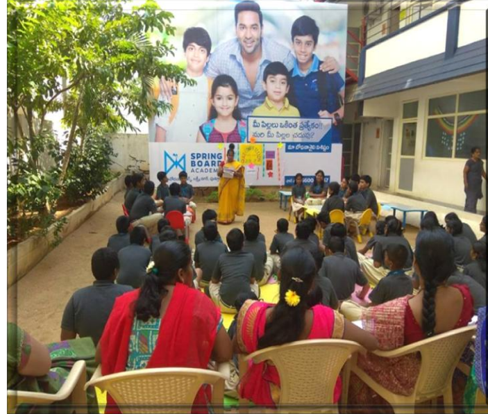
Students participating actively in the quiz competition