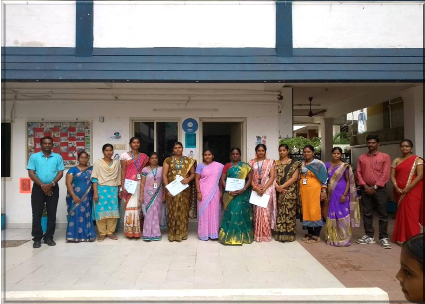
Teachers of SBA, Puttur