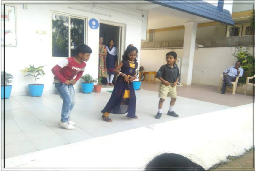
Children performing dance energetically