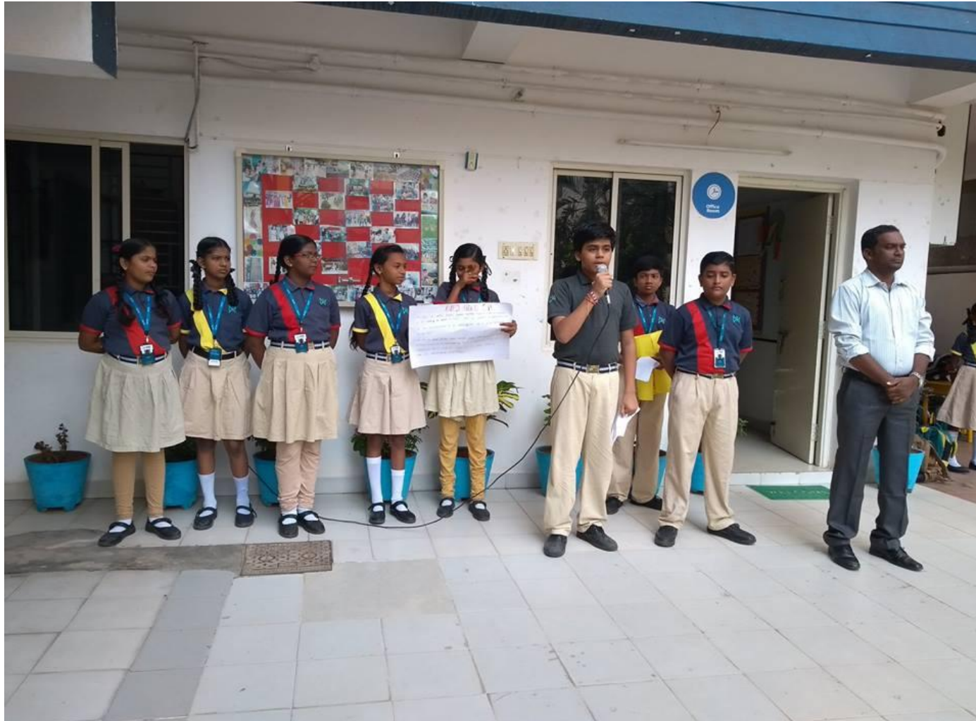
Speech by a student