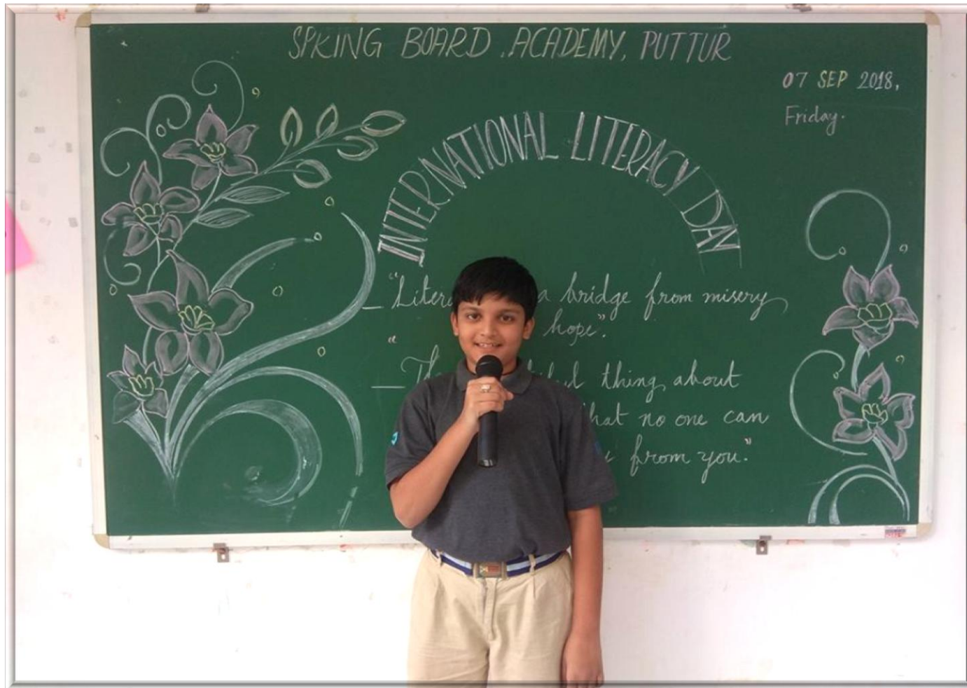
Speech by a student of Grade 7