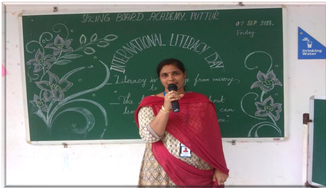
Speech by a teacher

This year's theme explores integrated approaches that simultaneously support the development of literacy and skills, to ultimately improve the lives of people and contribute to equitable and sustainable societies. Teachers and students delivered speech on importance of education.