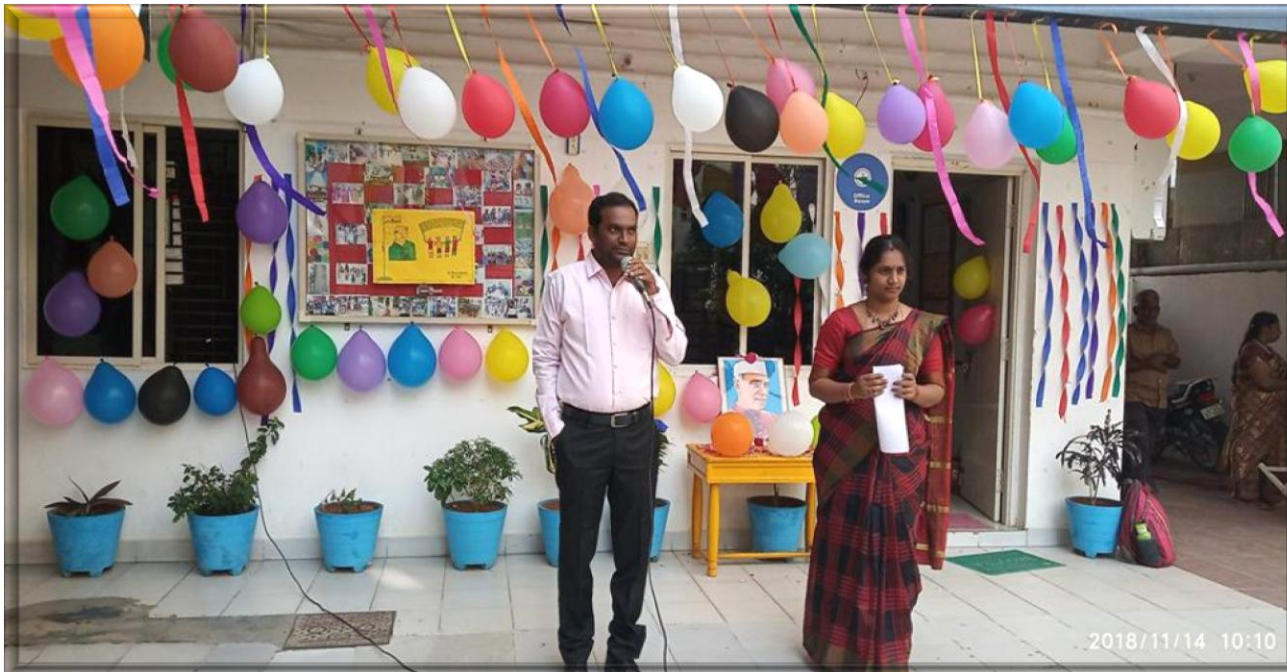
Principal delivering speech

Children were dressed in their best, bringing a festive look to the school. On the occasion, different games were conducted. Students performed well in dances and skit. Prizes were distributed to children to encourage and support their talent.