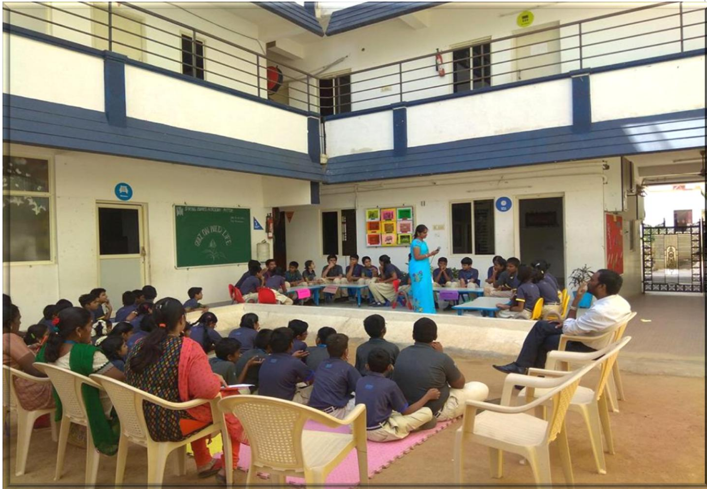
Children participating actively in the competition