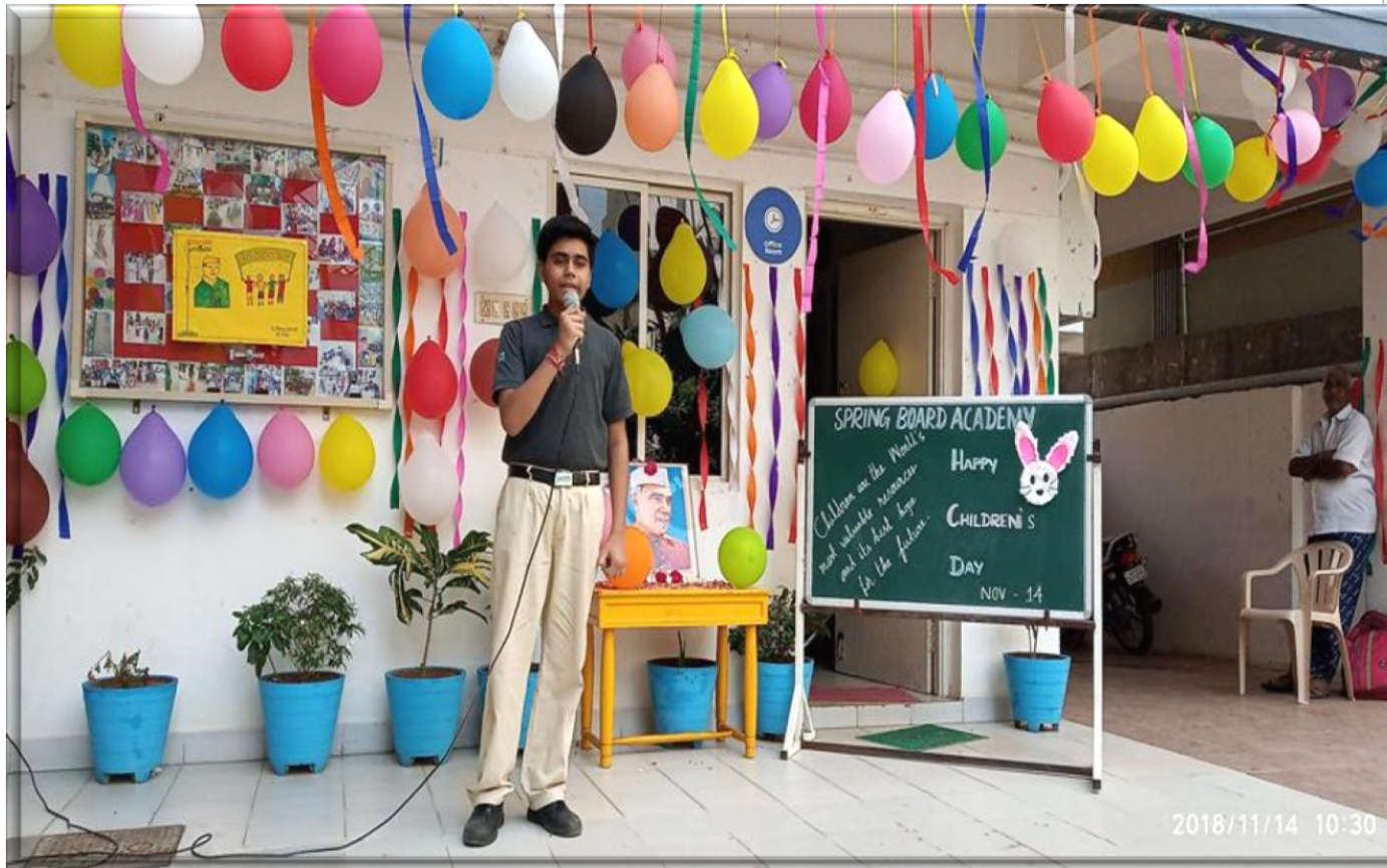
Speech by a student of grade 9