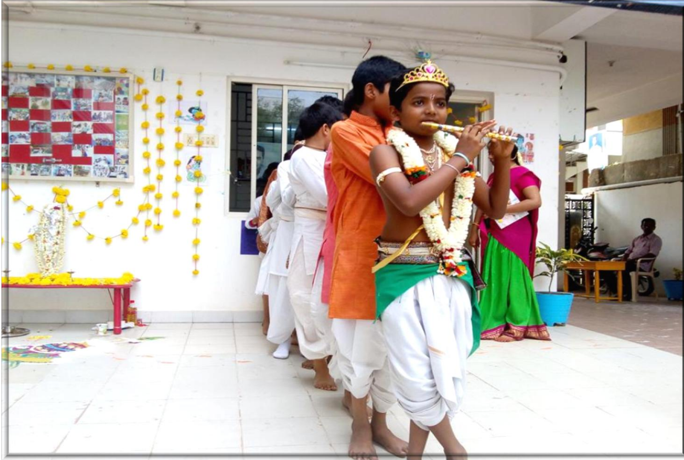
Dance by students of SBA, Puttur