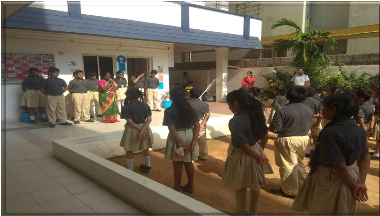
Hindi teacher delivering speech on the importance of Hindi

Hindi teachers spoke about the importance of Hindi as our National language and gave information to the students regarding renowned poets in Hindi and their works.