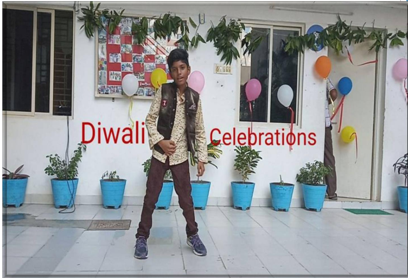
Dance by a student of Grade 6