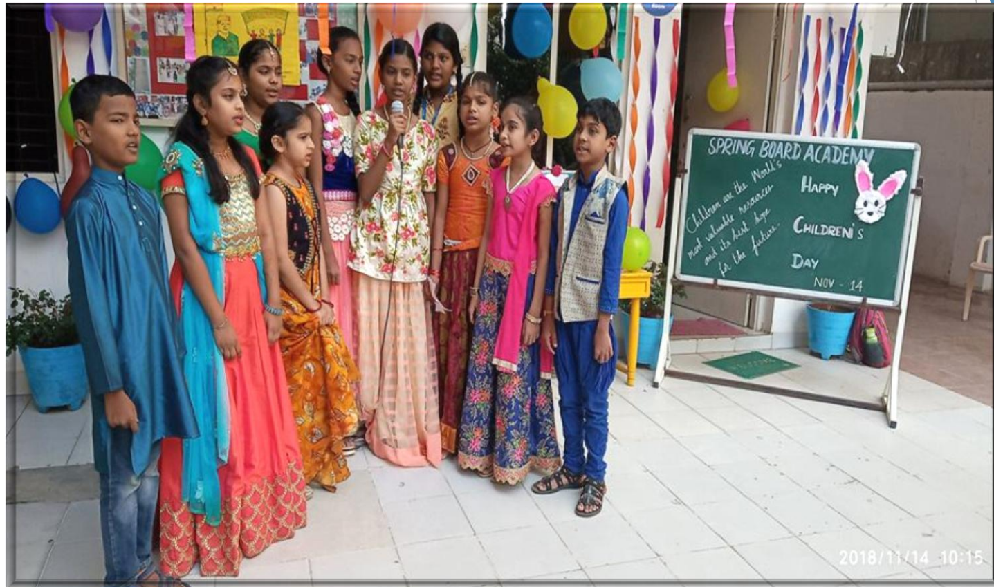
Children singing a song