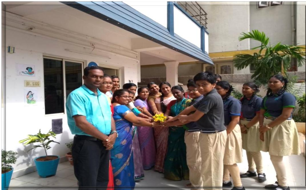
Students wishing teachers on Teachers' Day

Principal spoke about Dr. Sarvepalli Radhakrishnan and emphasized the role of a teacher in shaping the life of students. Students also delivered speech regarding role of teachers in their success.