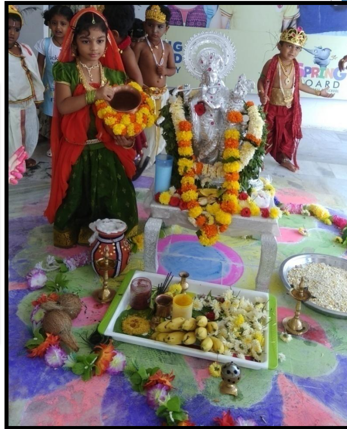
Students dressed like Krishna & Gopika