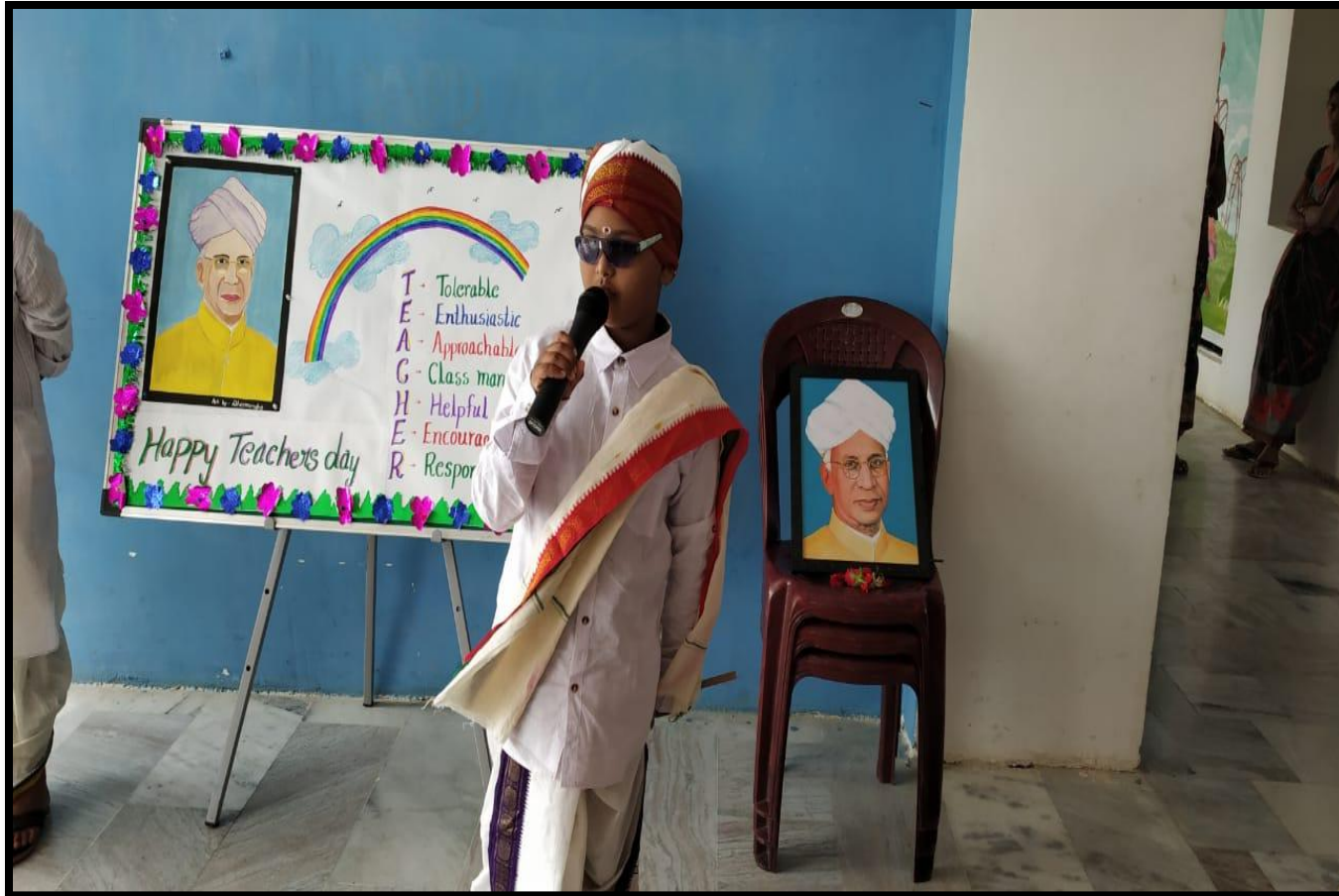
Delivering speech on Teachers' day