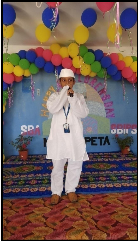
Student dressed as Nehru and delivering a speech