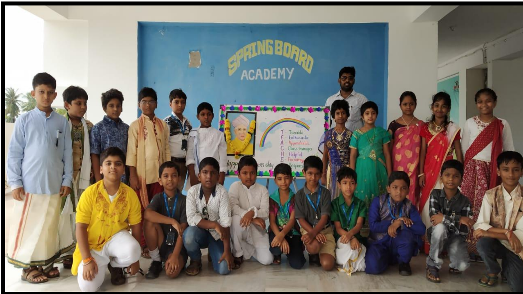
Children dressed like their favorite teachers