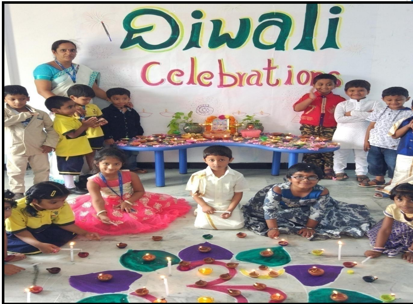
Eco friendly Diwali celebrations in Spring Board Academy - Mandapeta