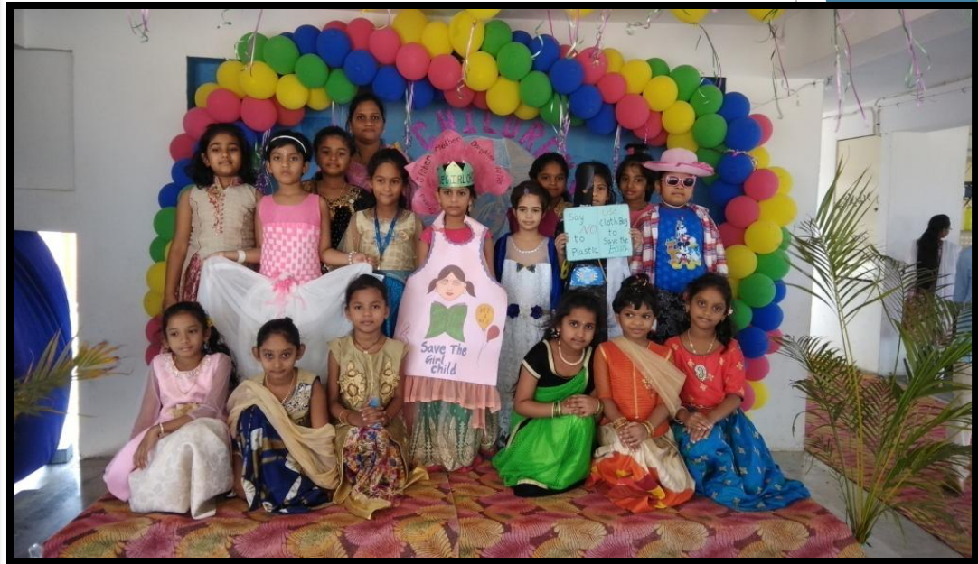
Students participating in the fancy dress show