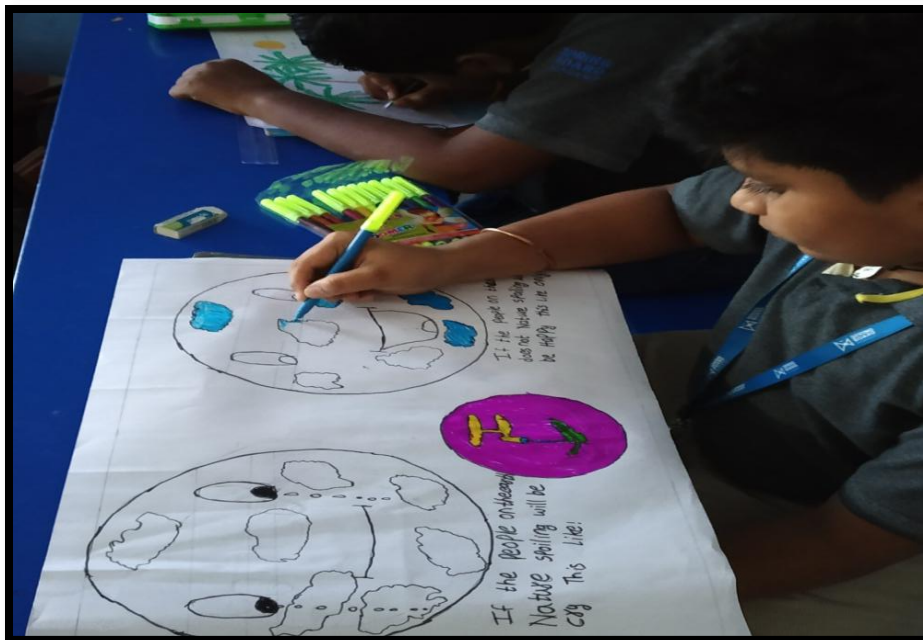
Creative Spot Painting talents