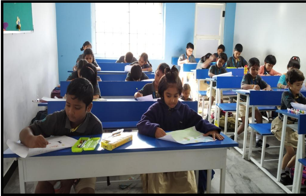
Creative Spot Painting talents