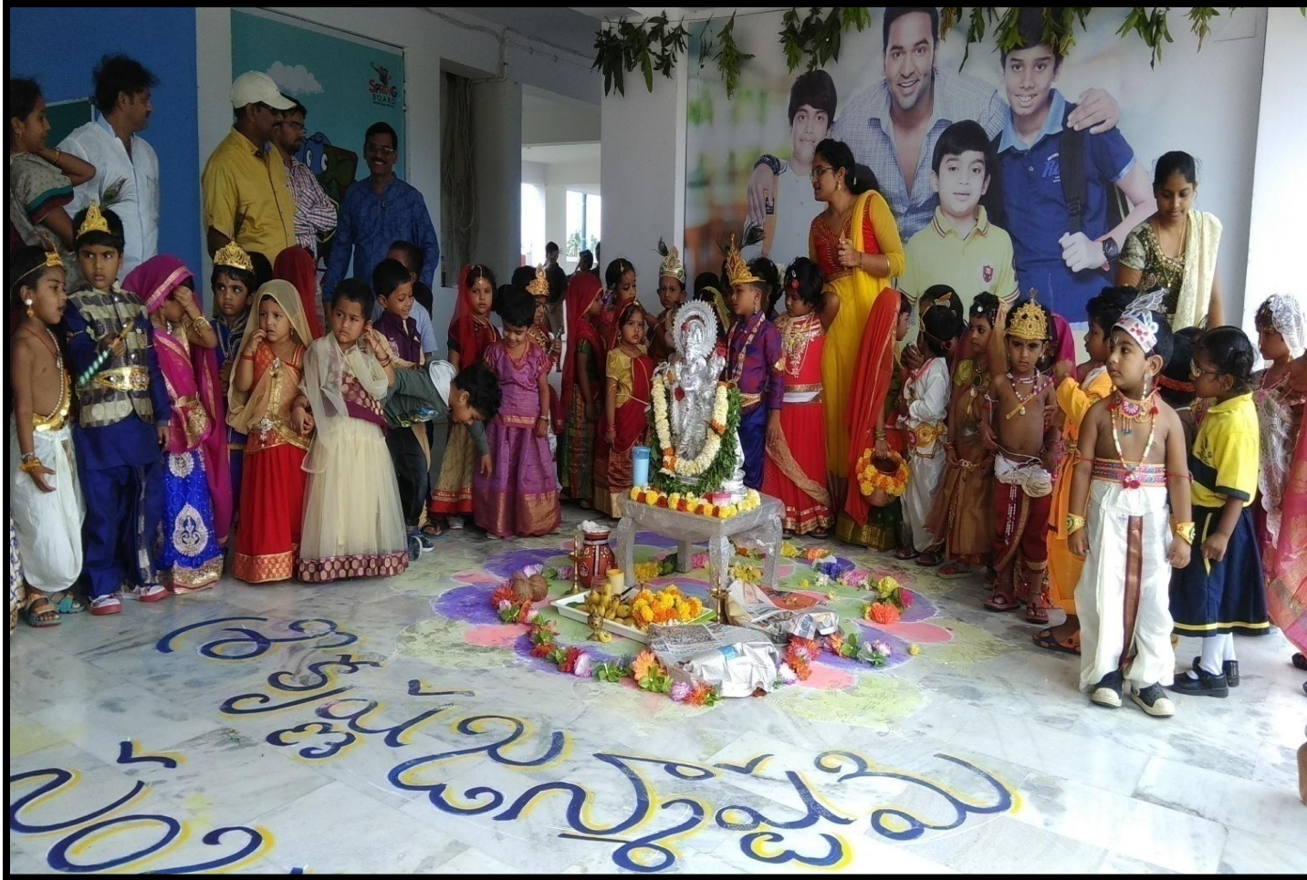
Students dressed like Krishna & Gopika