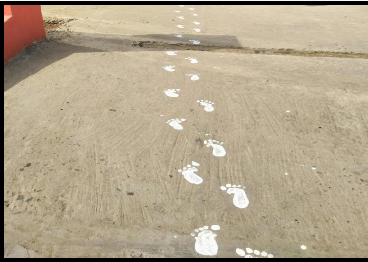
Lord Krishna foot prints