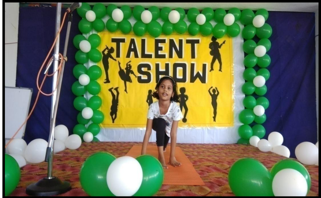
Children exhibiting their talents