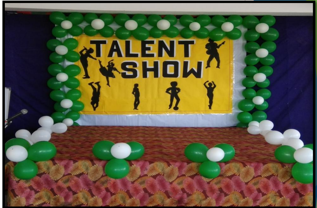
Children exhibiting their talents