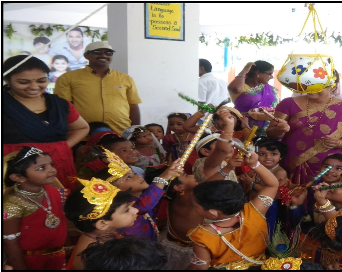
Fun in breaking the pot