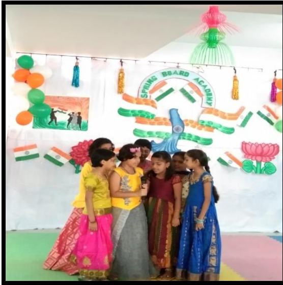
Song by Grade 3 Students