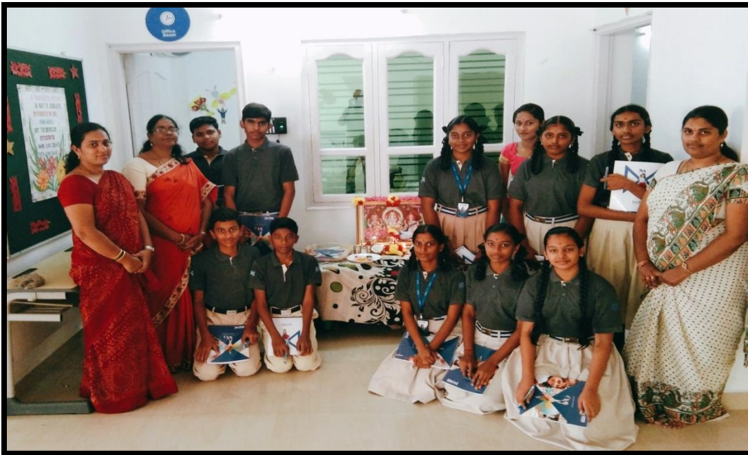
Students during the Pooja