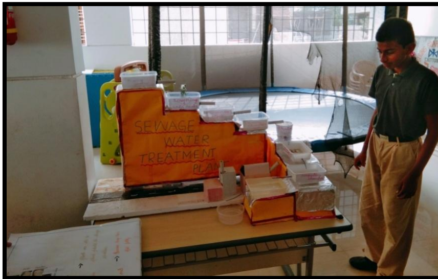
Students with their projects