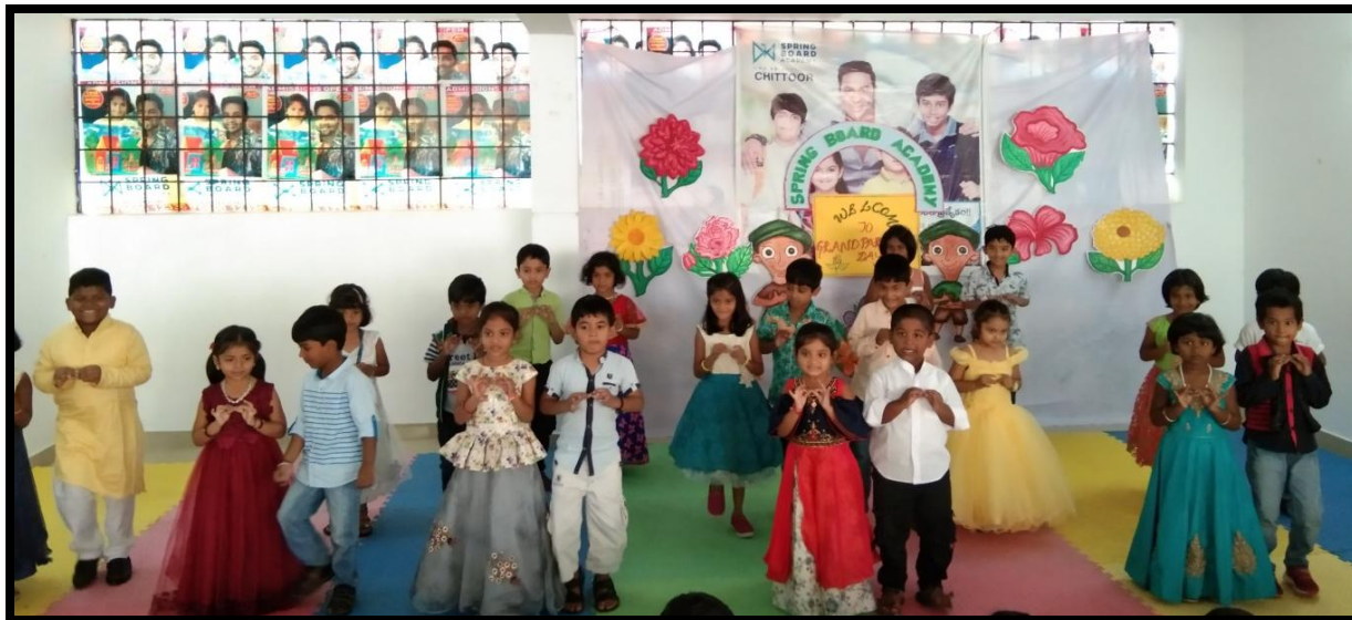
Dance by pre-primary students