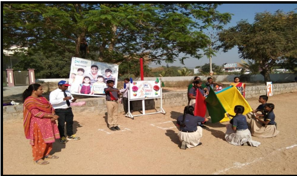
Oath by all the house captains