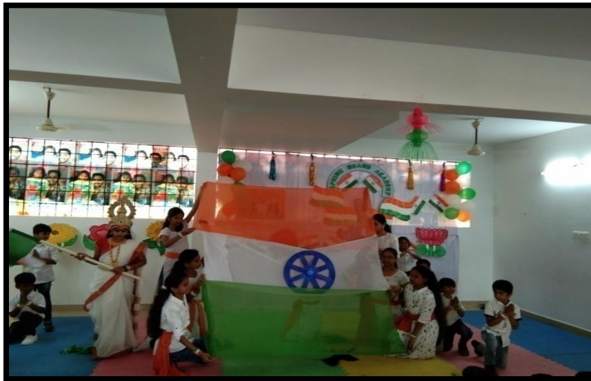
Dance by grade 1 and 2 students