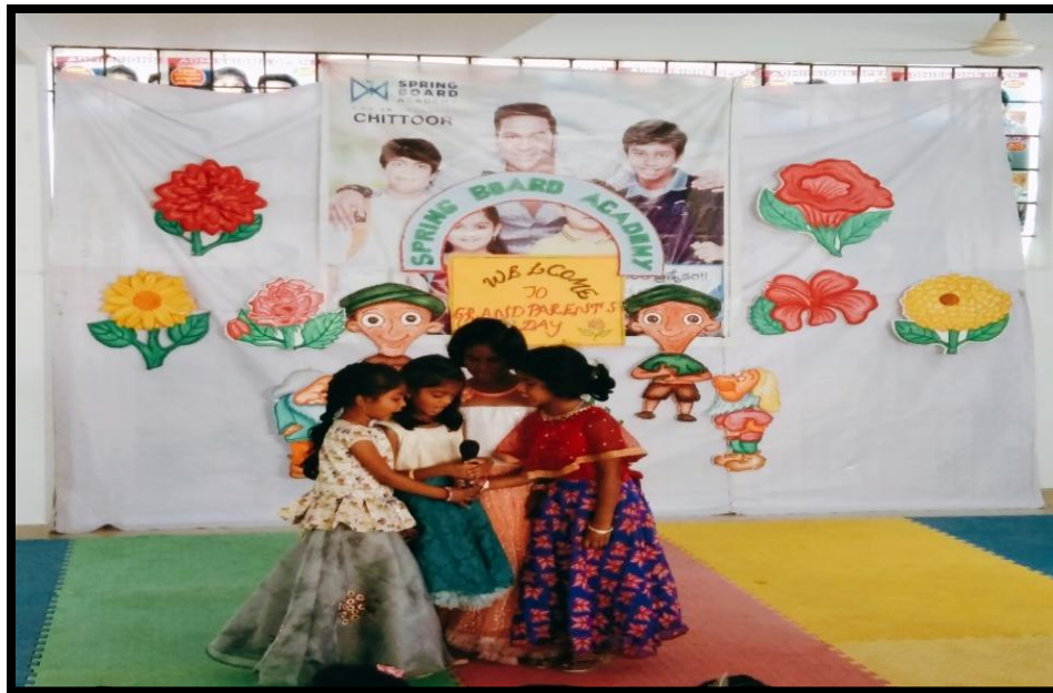
Song by Pre-Primary