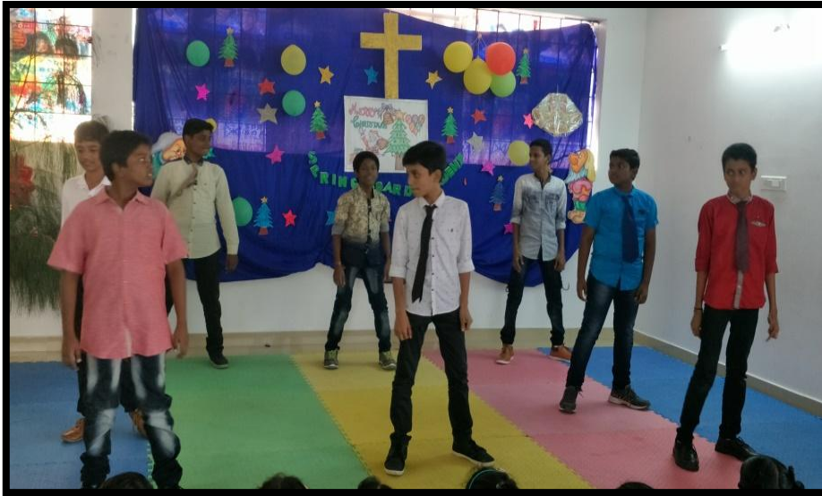
Dance by grade 8 Students