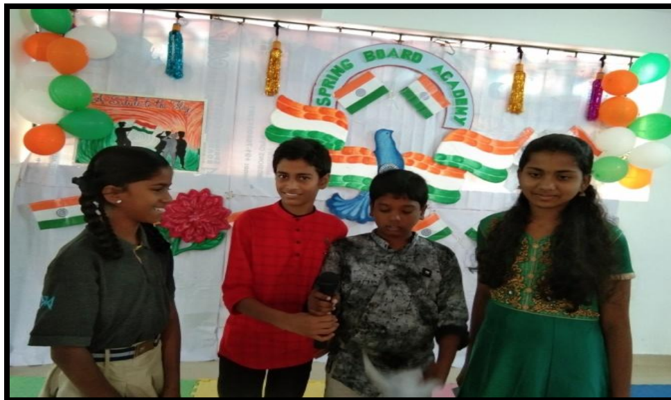
Patriotic Song by Grade 8 Students