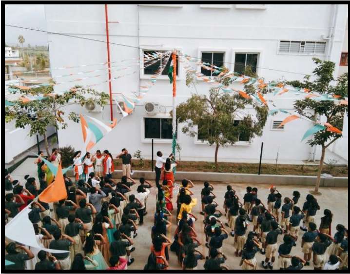
Flag Hoisting Ceremony