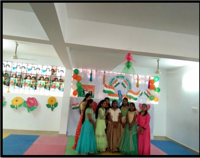
Patriotic song by grade 5 students