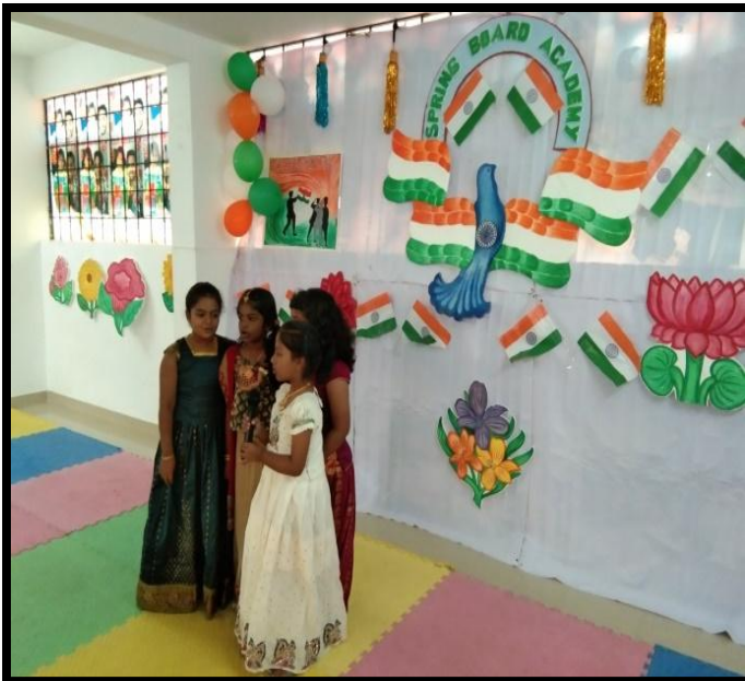
Patriotic song by Grade 3 Students