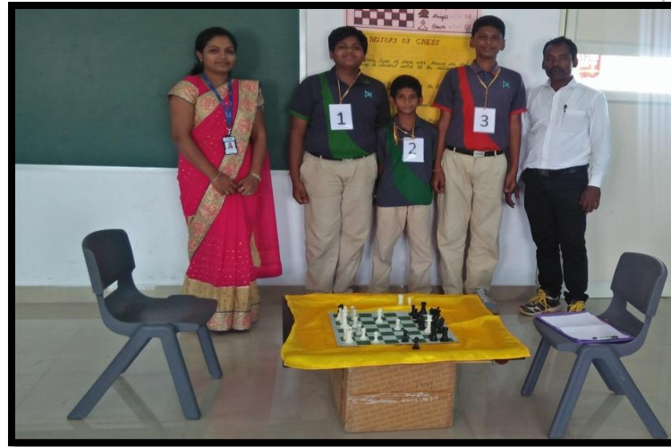
Winners of chess competition