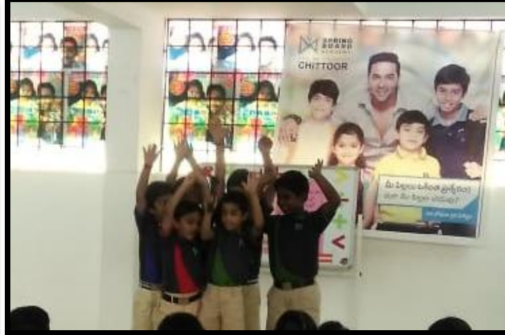
Song by Grade 2 students