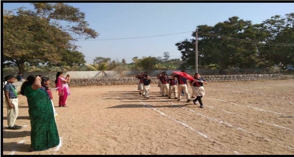
March past by Red House