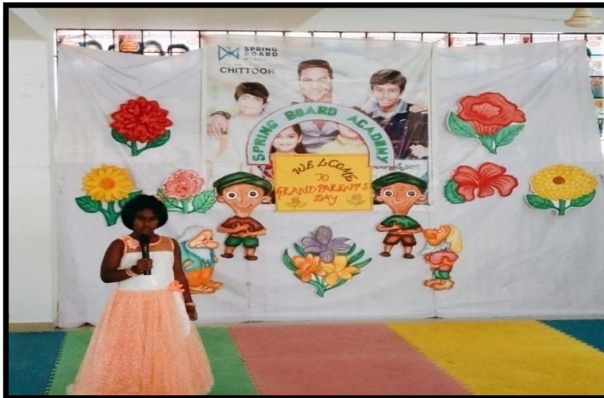
Speech by Bhrithi Church