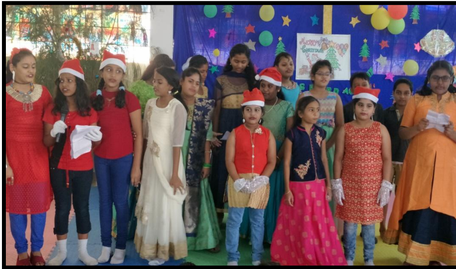
Jingle Bells Song by Students