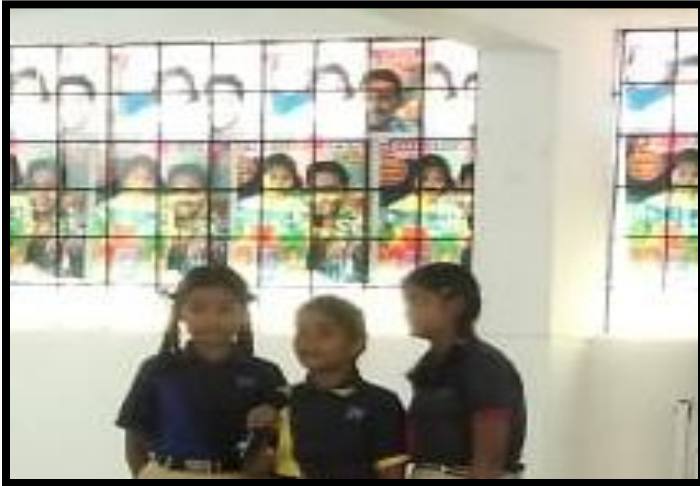
Song by Grade 6 students