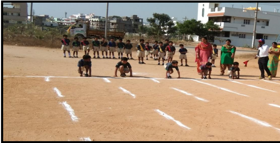
Running Race for grade 1 and 2 boys