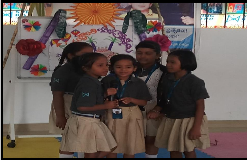
Song by Grade 2 Students