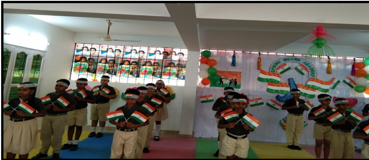
Flag Exercise by Students