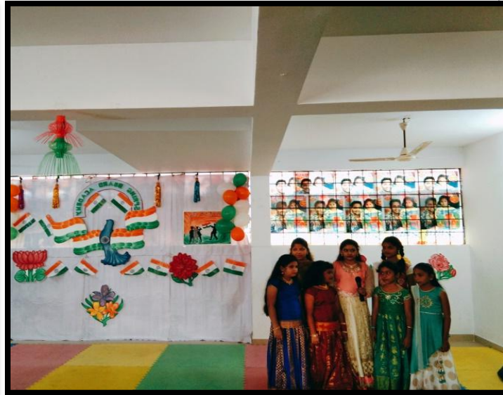
Song by Grade 4 Students