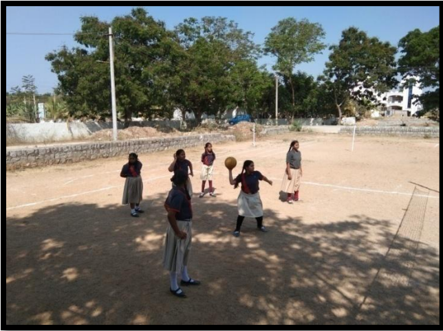
Volley Ball Match