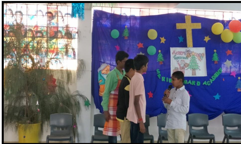
Skit by Class 8 Students