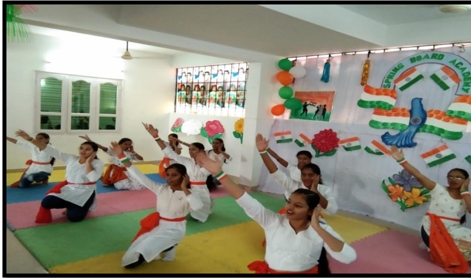
Patriotic dance by Grade 7, 8 and 9 Students