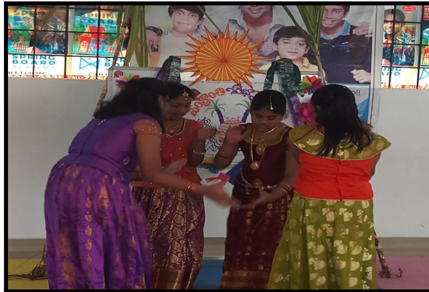
Gobbillu by Grade 5 Students