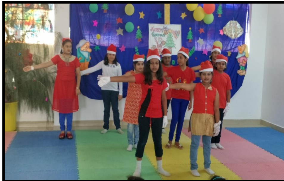
Dance by grade 3,4 & 5 Students