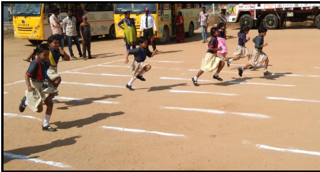
Running Race for grade 1 and 2 girls