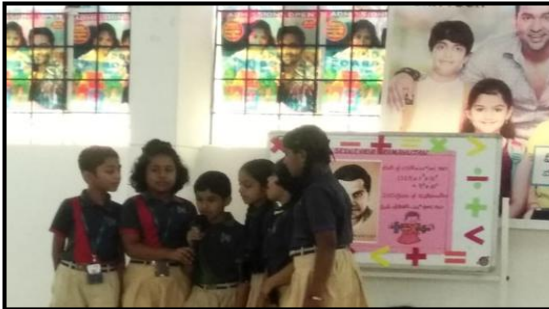
Song by Grade 3 students

The Green House bagged the first place in quiz competition and the Red House won the second place.