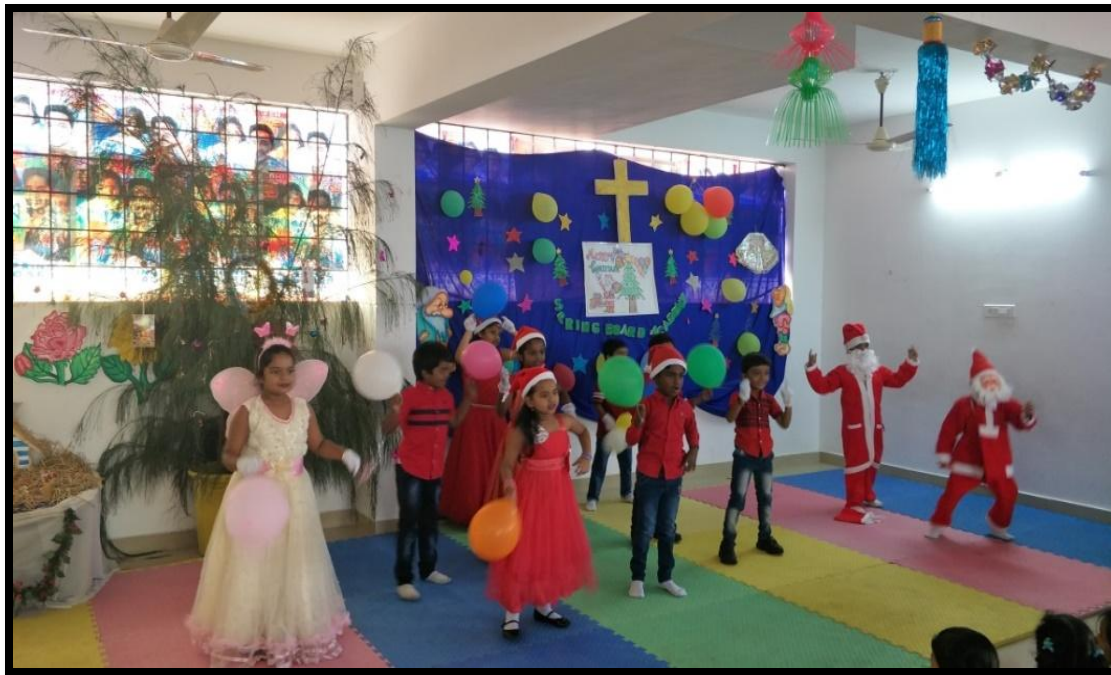
Dance by Grade 1 and 2 Students

Christmas was celebrated on 24 th December with great zeal in the school. On this day, a Christmas tree was decorated with lots of stars, bells, gifts, greeting cards, balloons and lights to make it look bright and beautiful. The Christmas crib exhibited figures that represented infant Jesus, Mary, Joseph shepherds, Kings and angles.