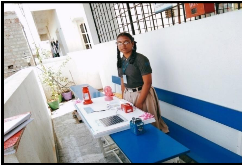
Students with their projects