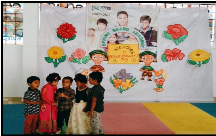
Song by pre-primary students