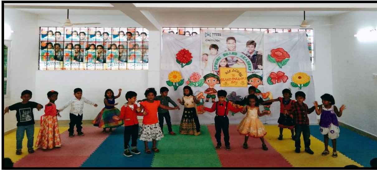
Dance by Pre-primary Students.